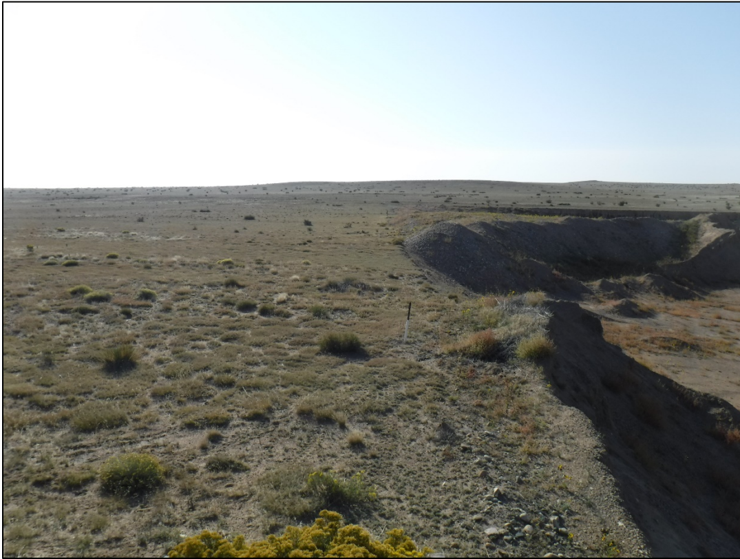
Photo 1: Looking south along the western permit boundary, WSG Hribar Pit to the right of picture