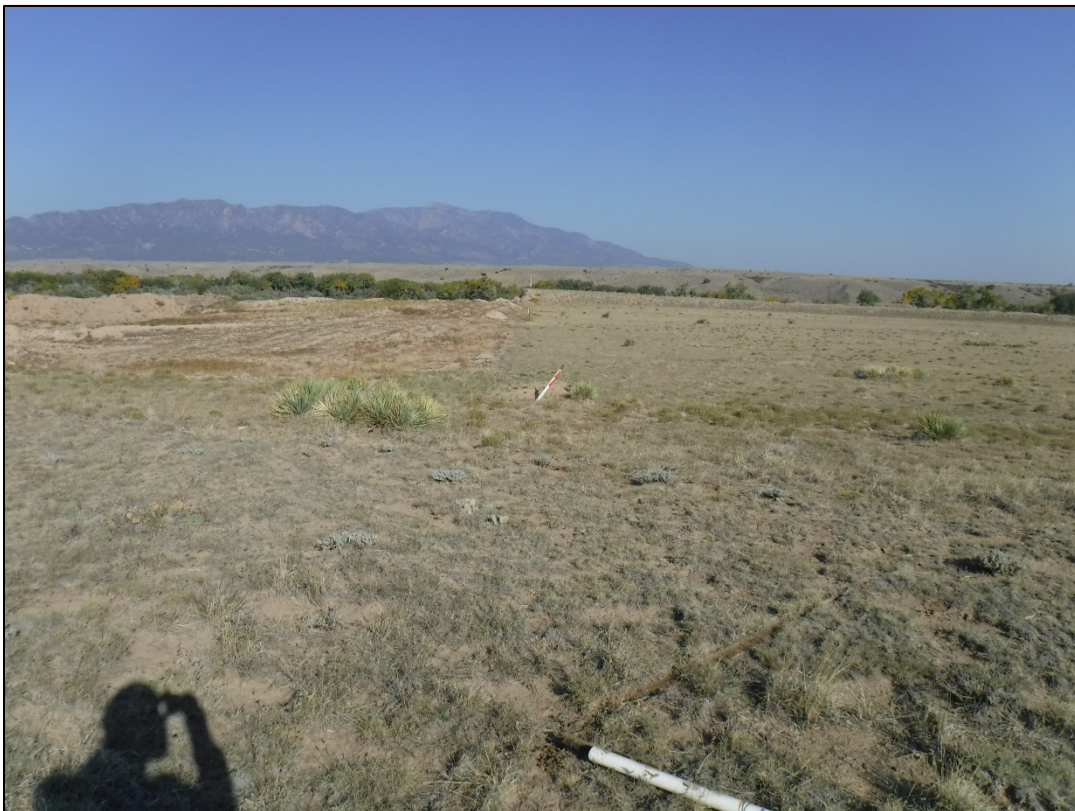
Photo 4: Looking north along western permit boundary from southwestern permit corner