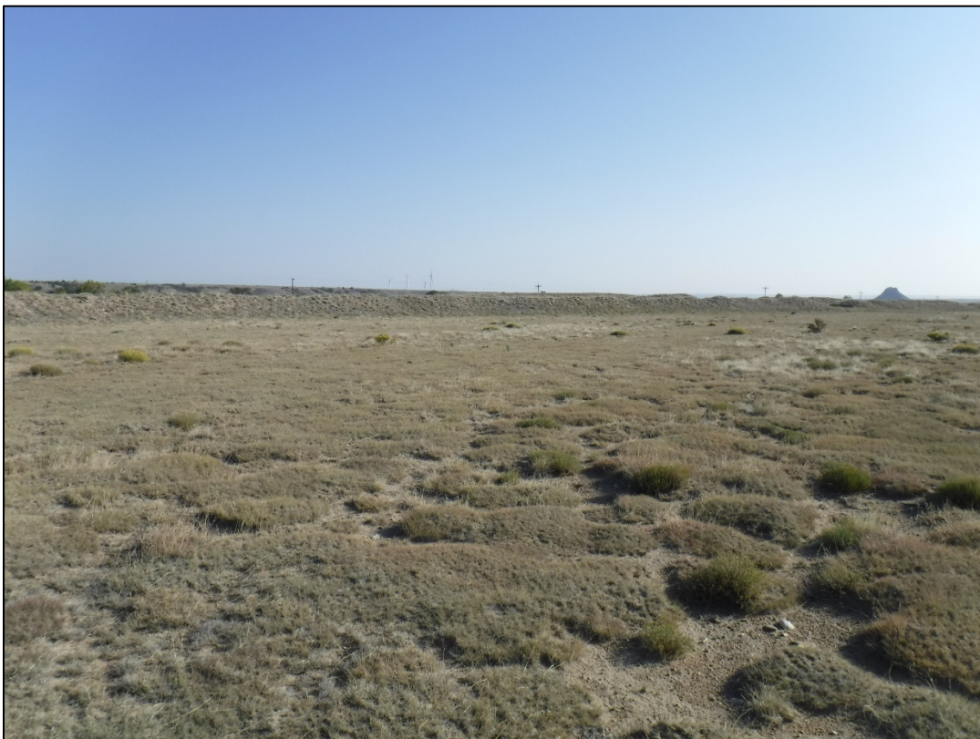
Photo 2: Looking east-northeast from western permit boundary across Phases 2 and 3, undisturbed