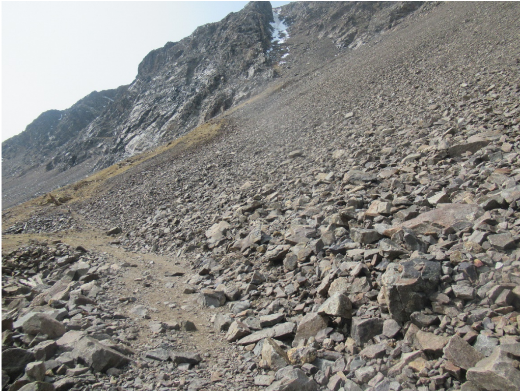
View of the proposed drill pad location looking south