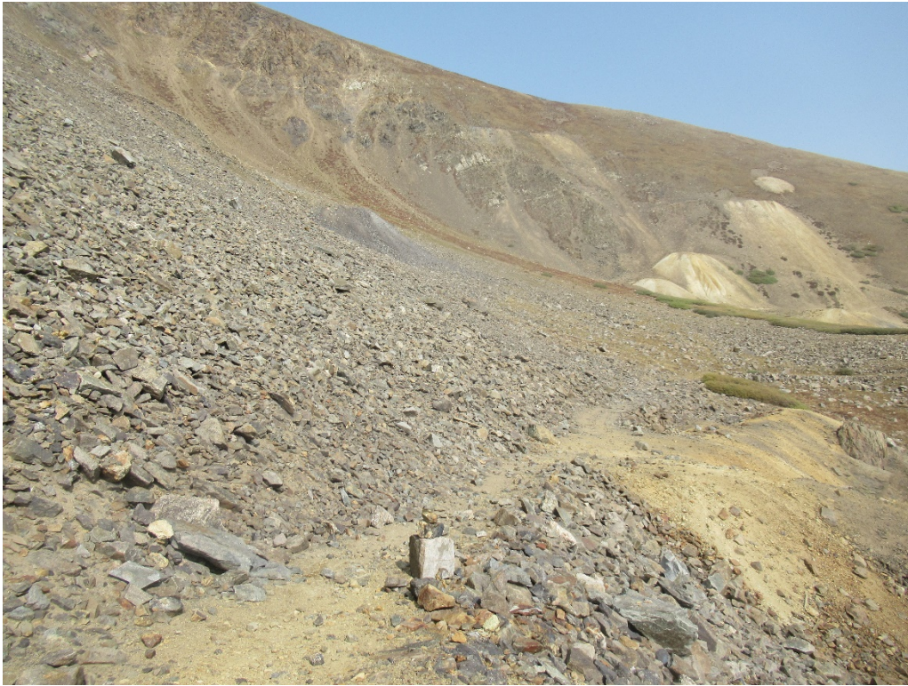
View of the proposed drill pad location looking north