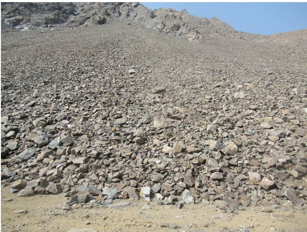
View of the proposed drill pad location looking west