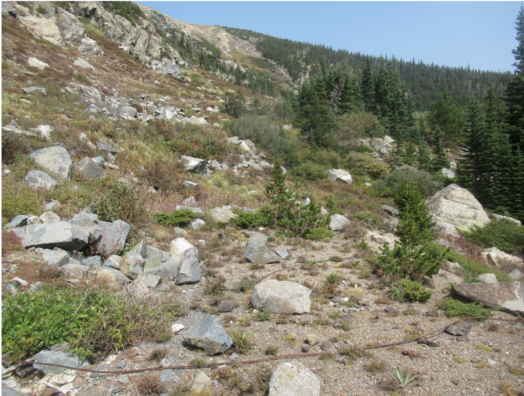
View of the placer claim from the south end looking north