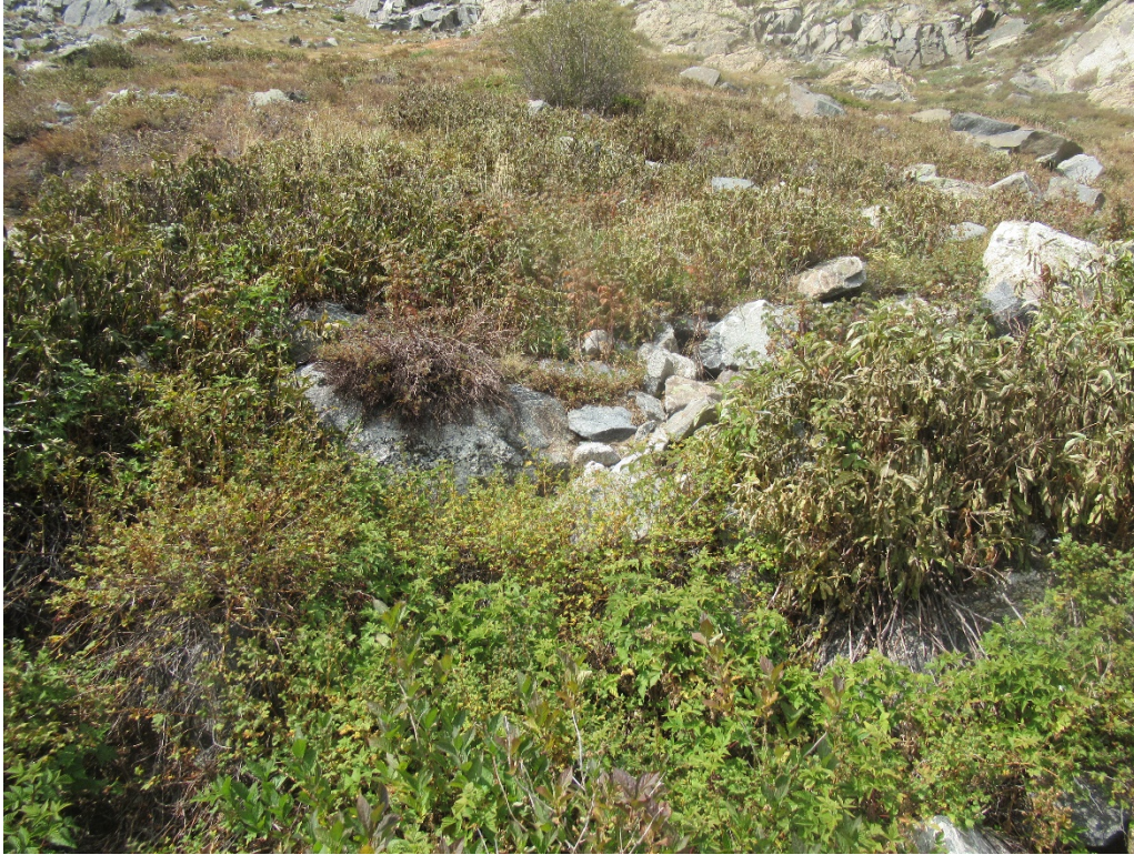
View of the hanging and foot walls