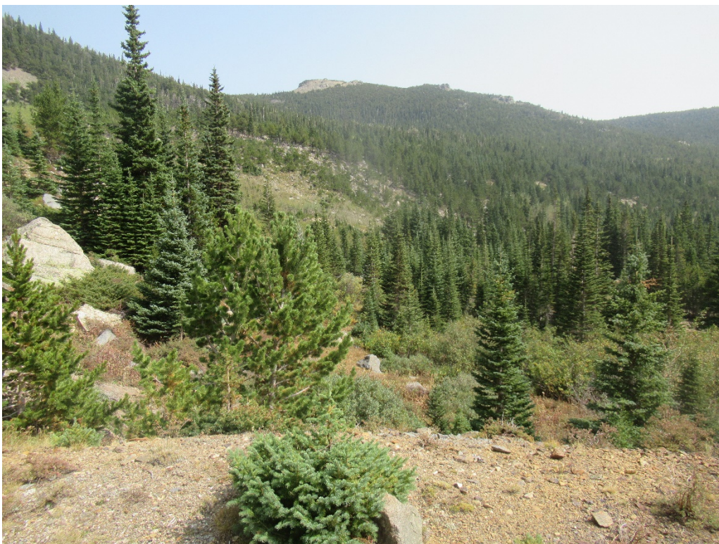
View of the lobe claim from the southwest end looking northeast