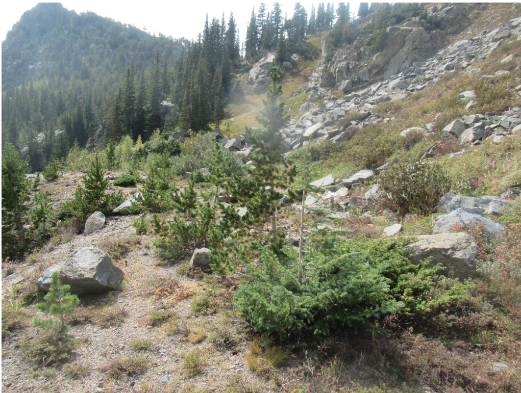
View of the placer claim from the north end looking south