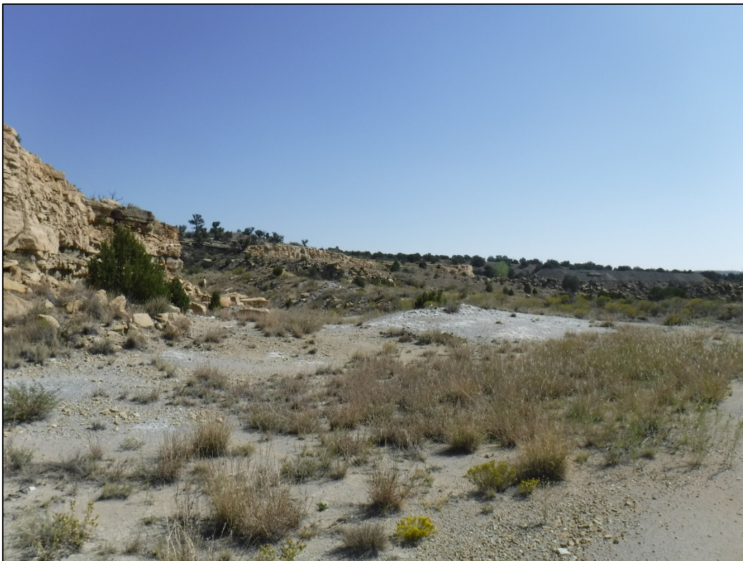
Photo 4: Looking from the Stone City mine towards the Tomahawk Mine (center right)