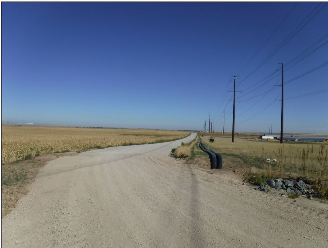
Photo 6: Haul road leading to mine entrance, looking north from mine entrance