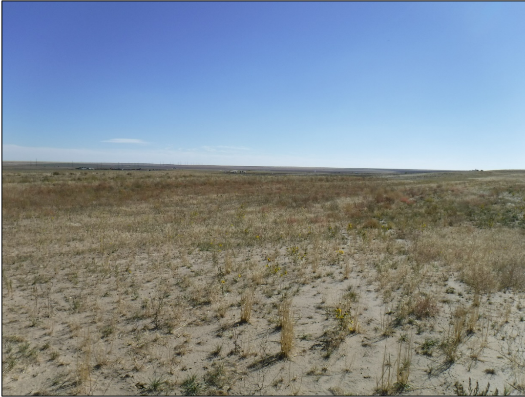
Photo 9: Revegetation established within mined area looking northeast