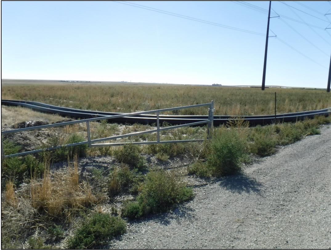
Photo 5: Gate that was installed by Kelley Trucking that is no longer in use.