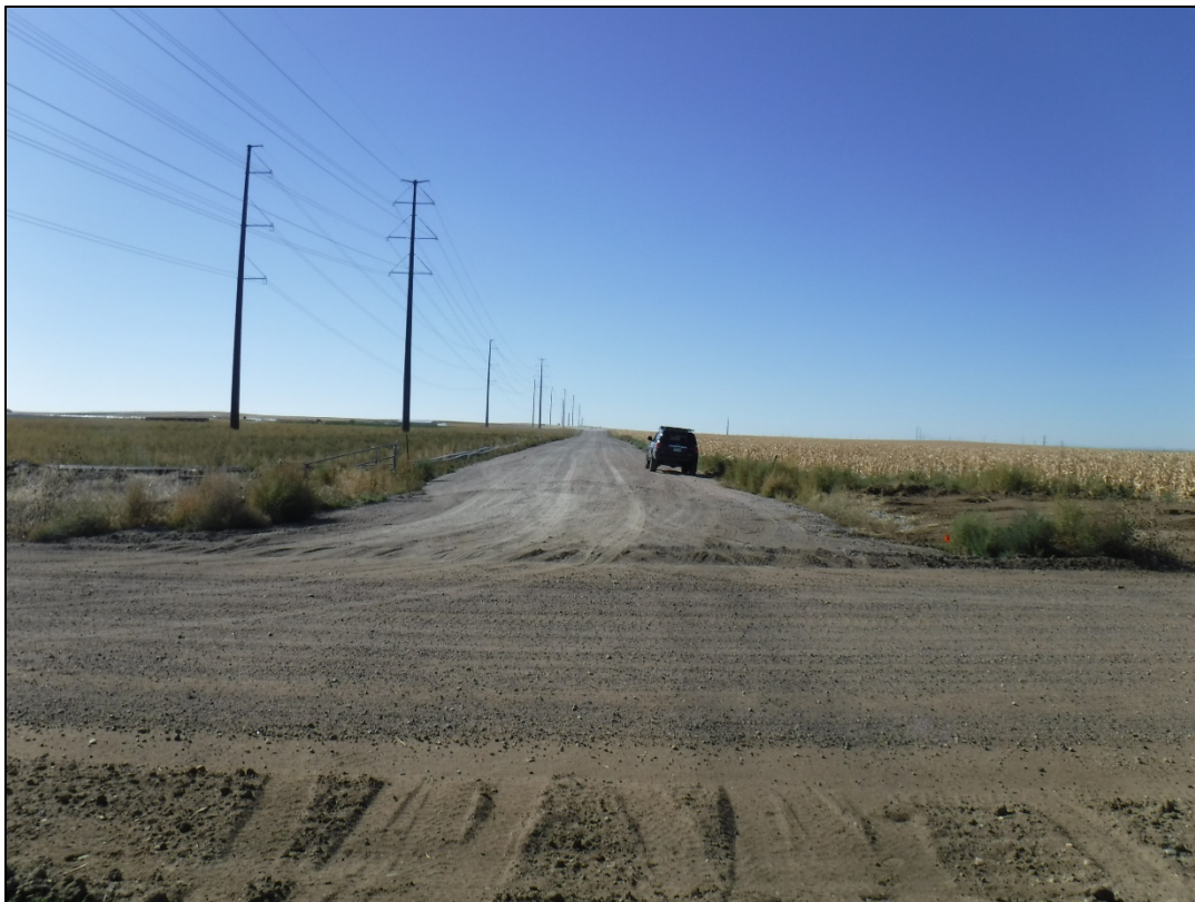
Photo 4: Looking south at the intersection, objector's property is on the right side of photo