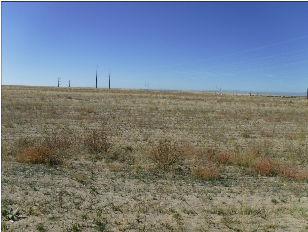
Photo 10: Revegetation established within mined area looking southwest