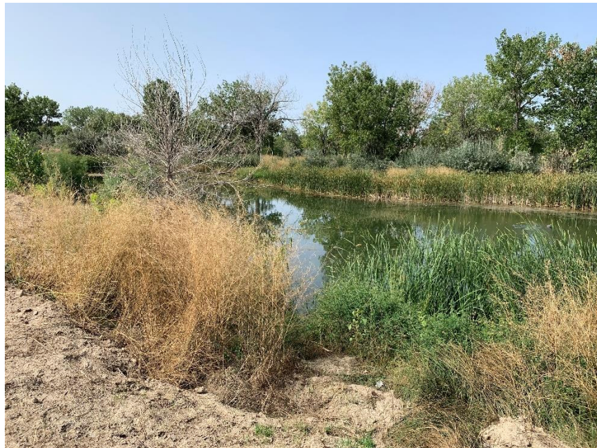
Southwest bank of pond facing southwest