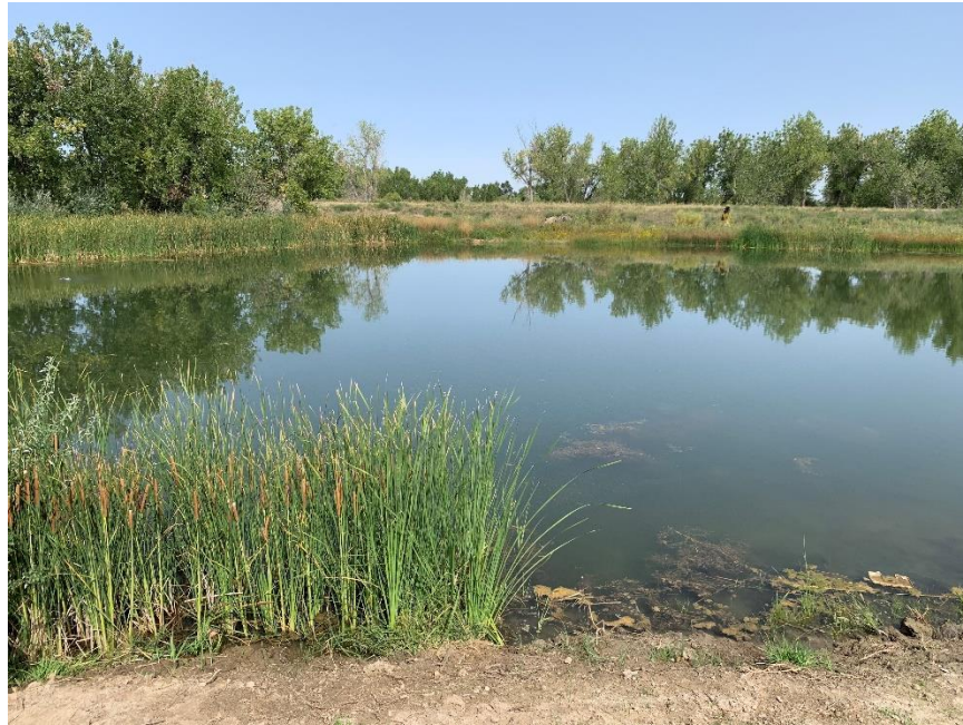
Northwest corner of pond