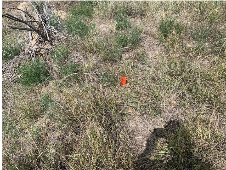
Boundary marker on northwest corner