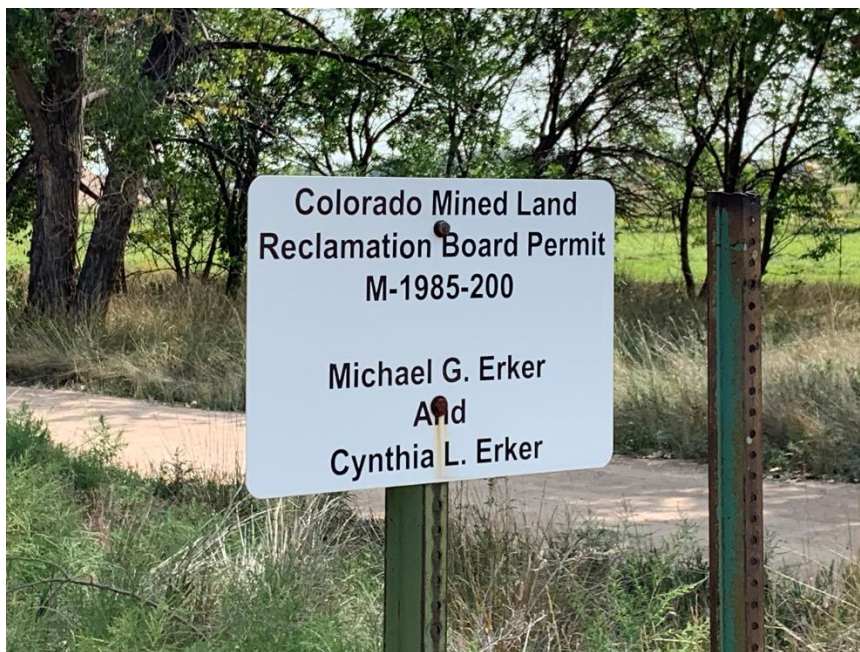
Mine entrance sign