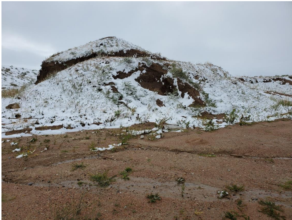
Topsoil Pile with Erosional Issue