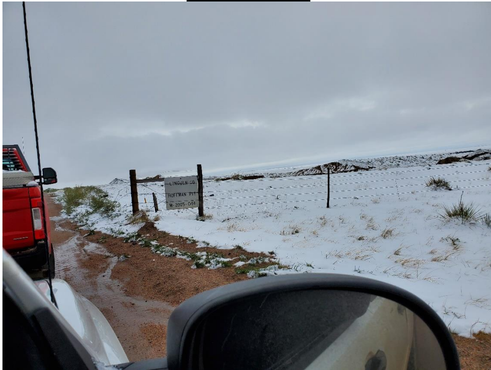
Mine Site Entrance