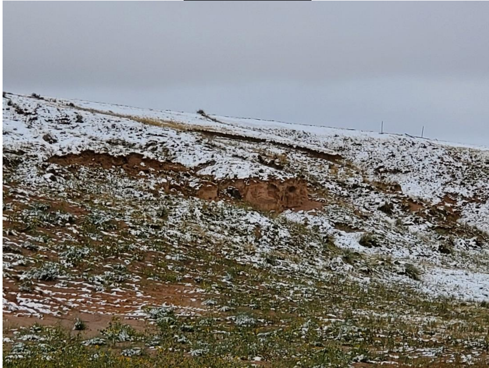
Area that needs to be sloped to 3H:1V