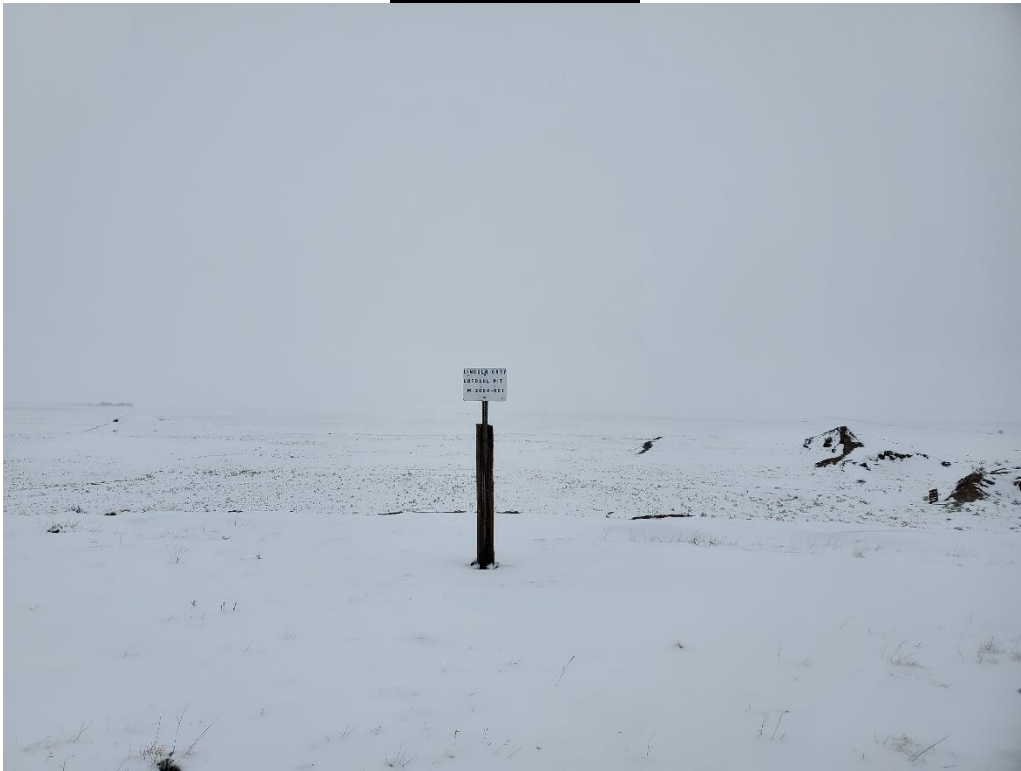
Mine Site Entrance