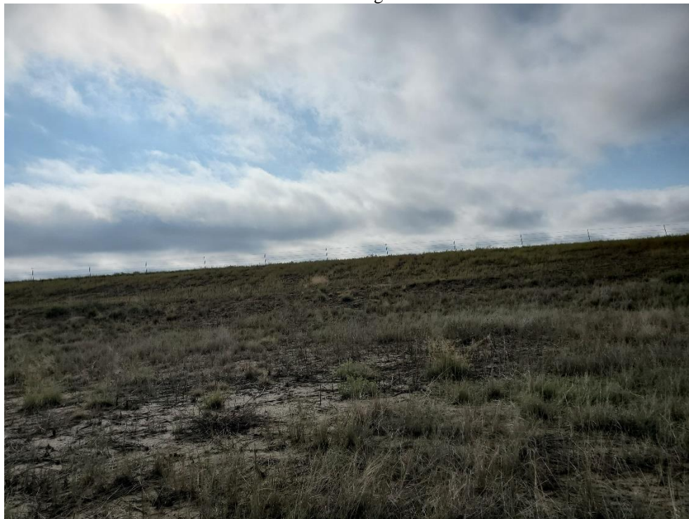
Permit Facing West