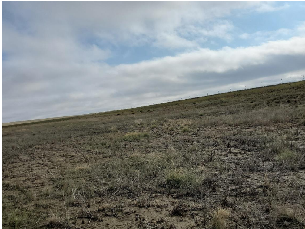
Permit Facing East