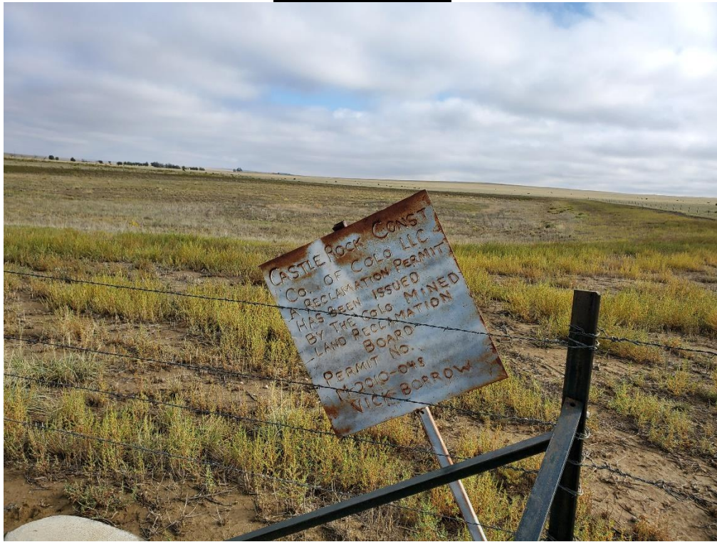
Mine Site Entrance