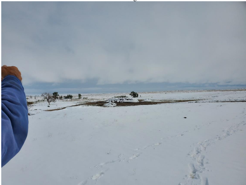
Rotomillings and Reclaimed Area of the Permit