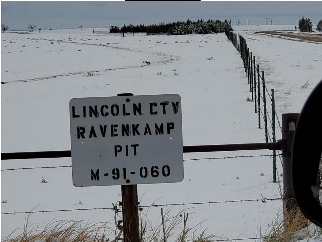
Mine Site Entrance