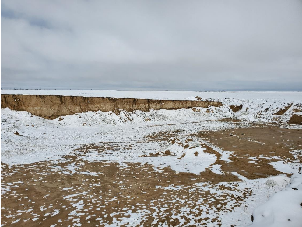
Pit floor facing West