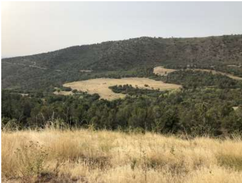
ROM Coal Storage and Timber Storage Areas

Number of Partial Inspection this Fiscal Year: 2