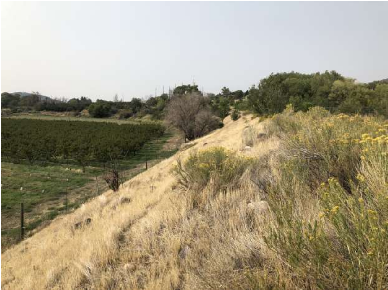
Hillside below the loadout (adjacent orchard on left)

Number of Partial Inspection this Fiscal Year: 2