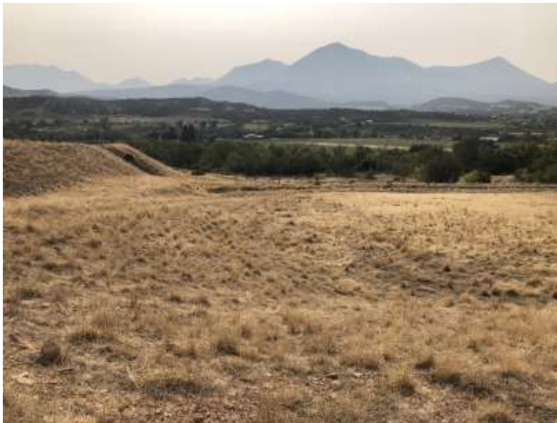
Coal Storage at Highway 133 and Black Bridge Road

Number of Partial Inspection this Fiscal Year: 2