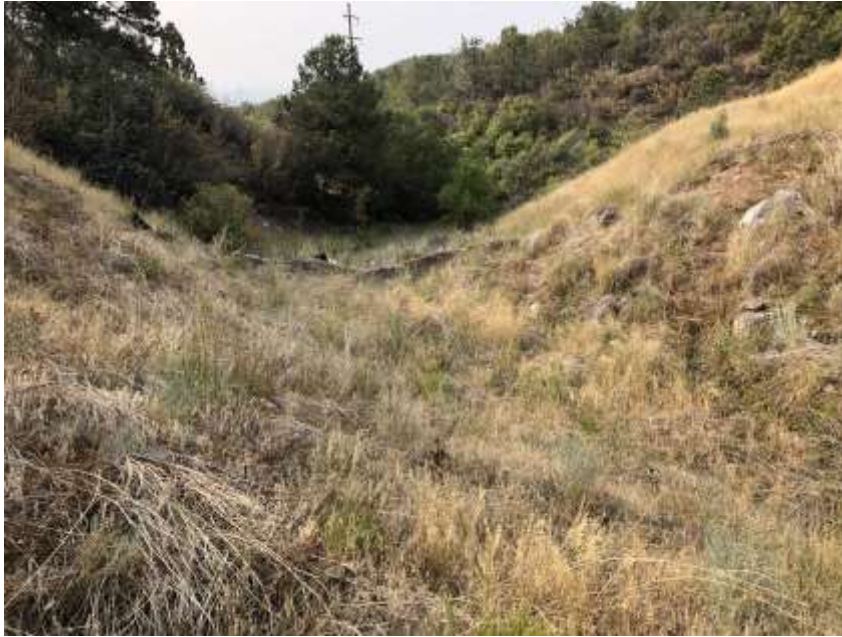
Silt fence below reclaimed Pond 4 (East Mine)