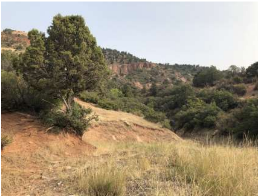
Juniper tree near reclaimed Pond 1

Number of Partial Inspection this Fiscal Year: 2