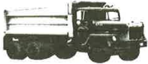
SAND & GRAVEL PRODUCTS Phone 242-7537

940 South 10th Street, P.O. Box 1769 GRAND JUNCTION, COLORADO 81502