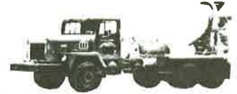
READY MIXED CONCRETE Phone 242-4843