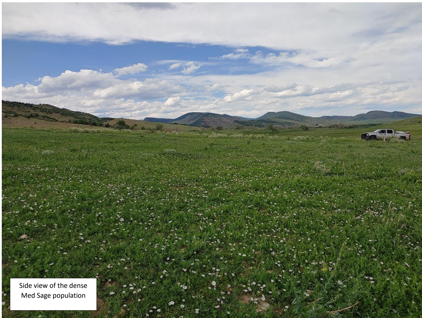
Side view of the dense Med Sage population