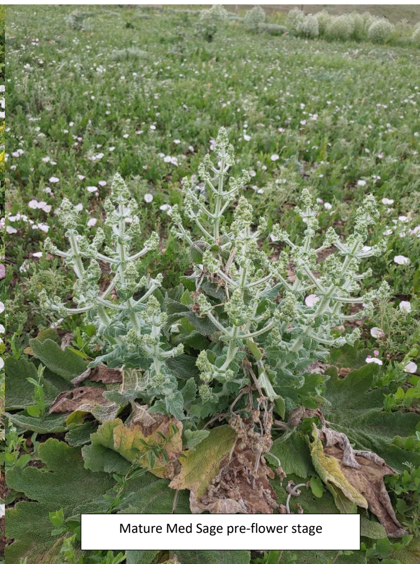
Mature Med Sage pre-flower stage