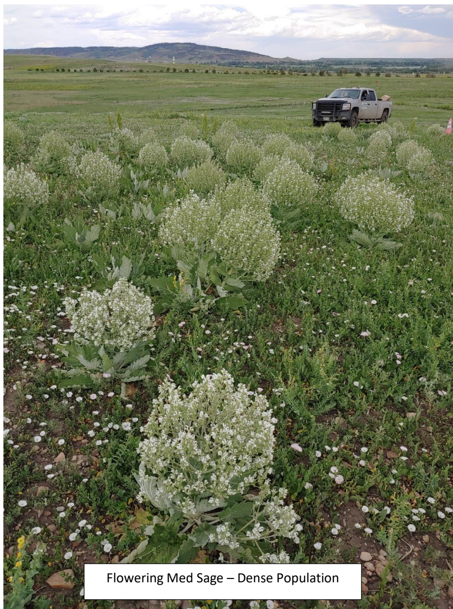
Flowering Med Sage – Dense Population