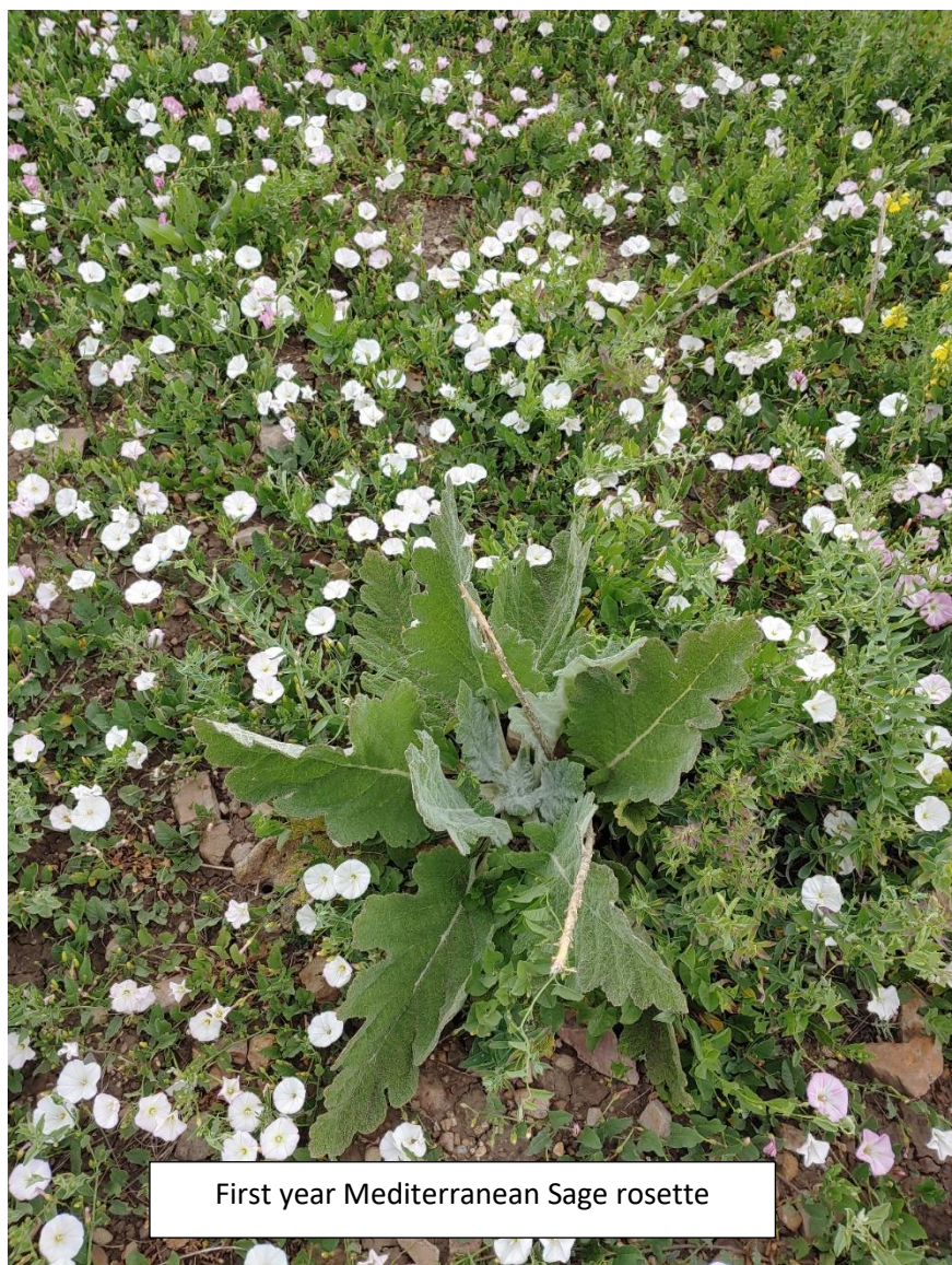
First year Mediterranean Sage rosette