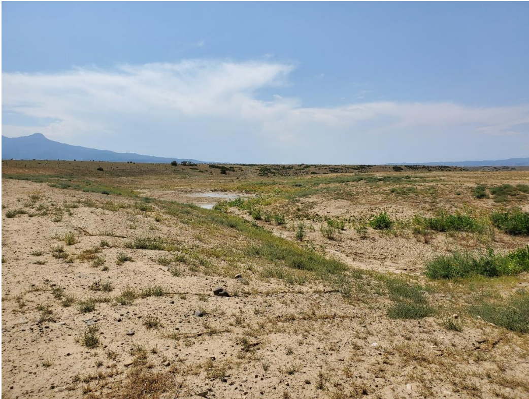
Small Body of Water