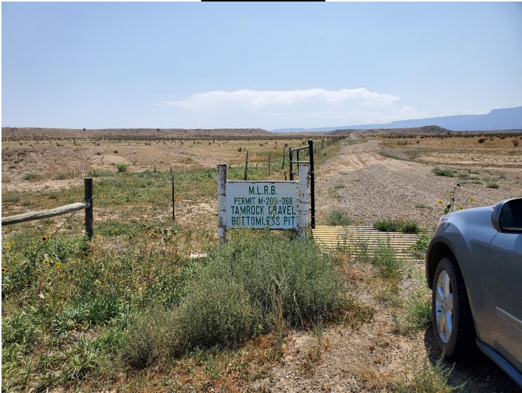
Mine Entrance Sign