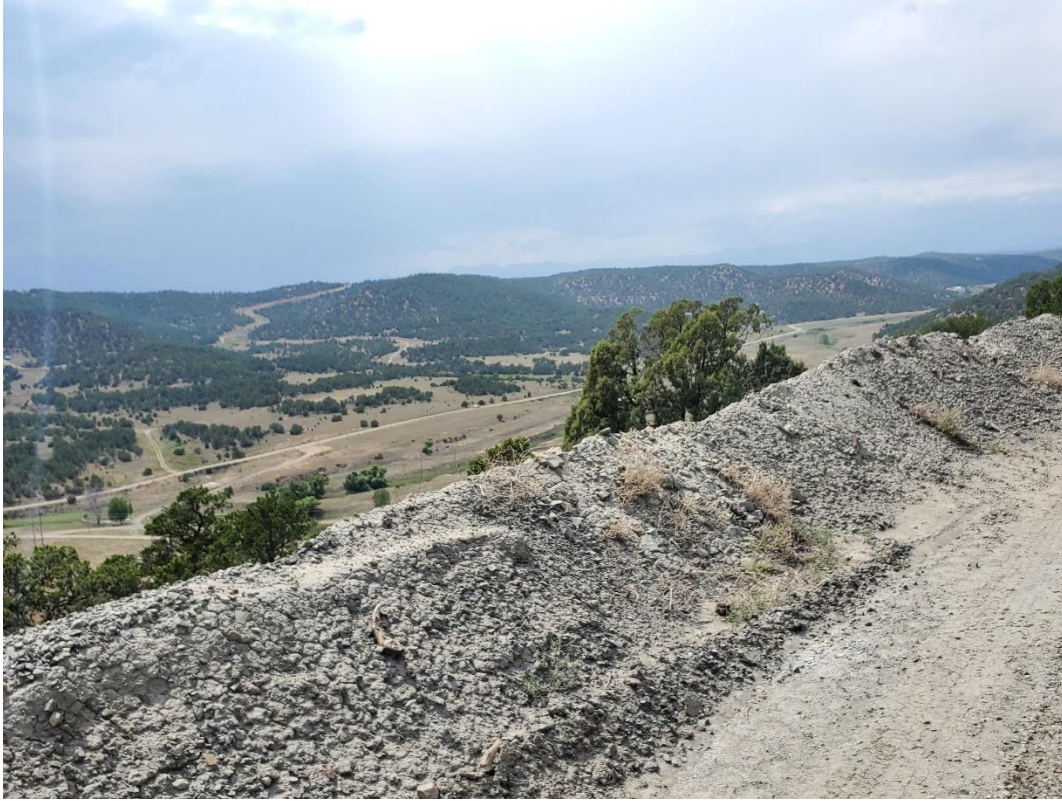
Berm Along Haul Road