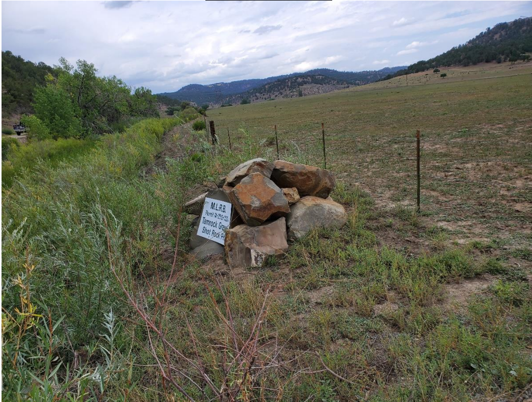
Mine Entrance Sign