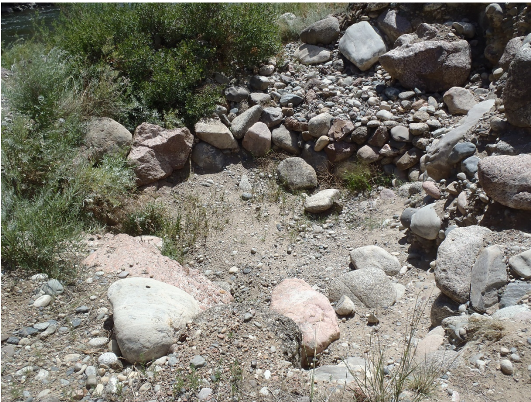
Photo 1. Active dry pit, smaller than during the 2018 inspection (looking south).