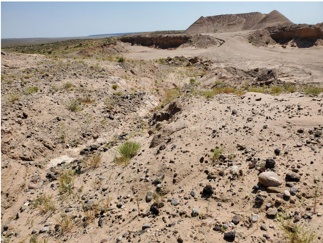
Erosional Issue developing