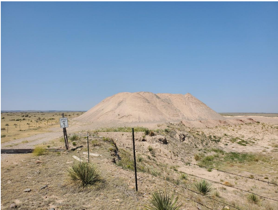
20,000 Ton Stockpile