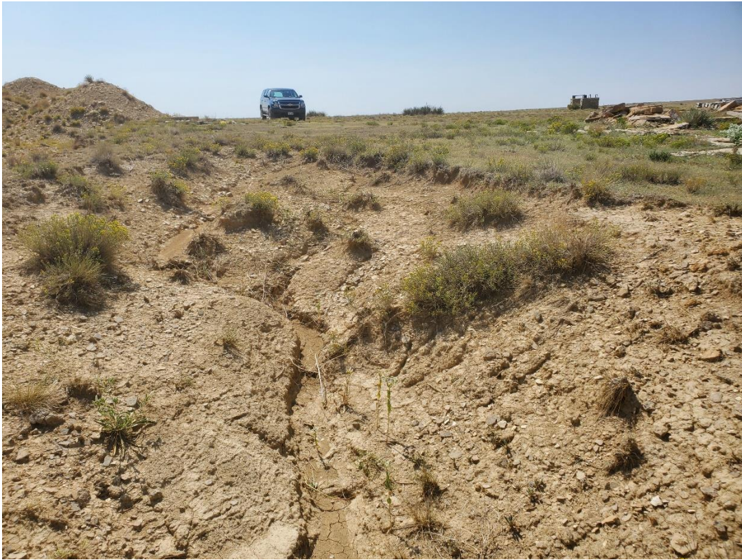
Beginning Erosional Issue Facing North