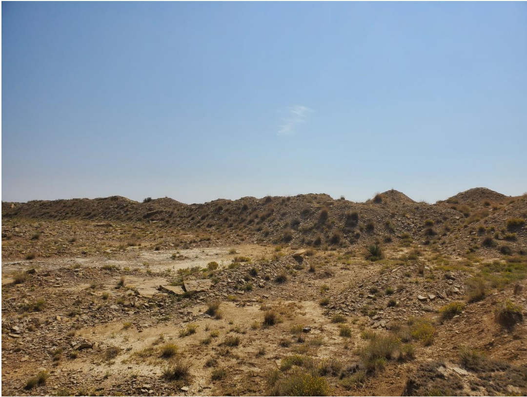
South Topsoil Stockpile