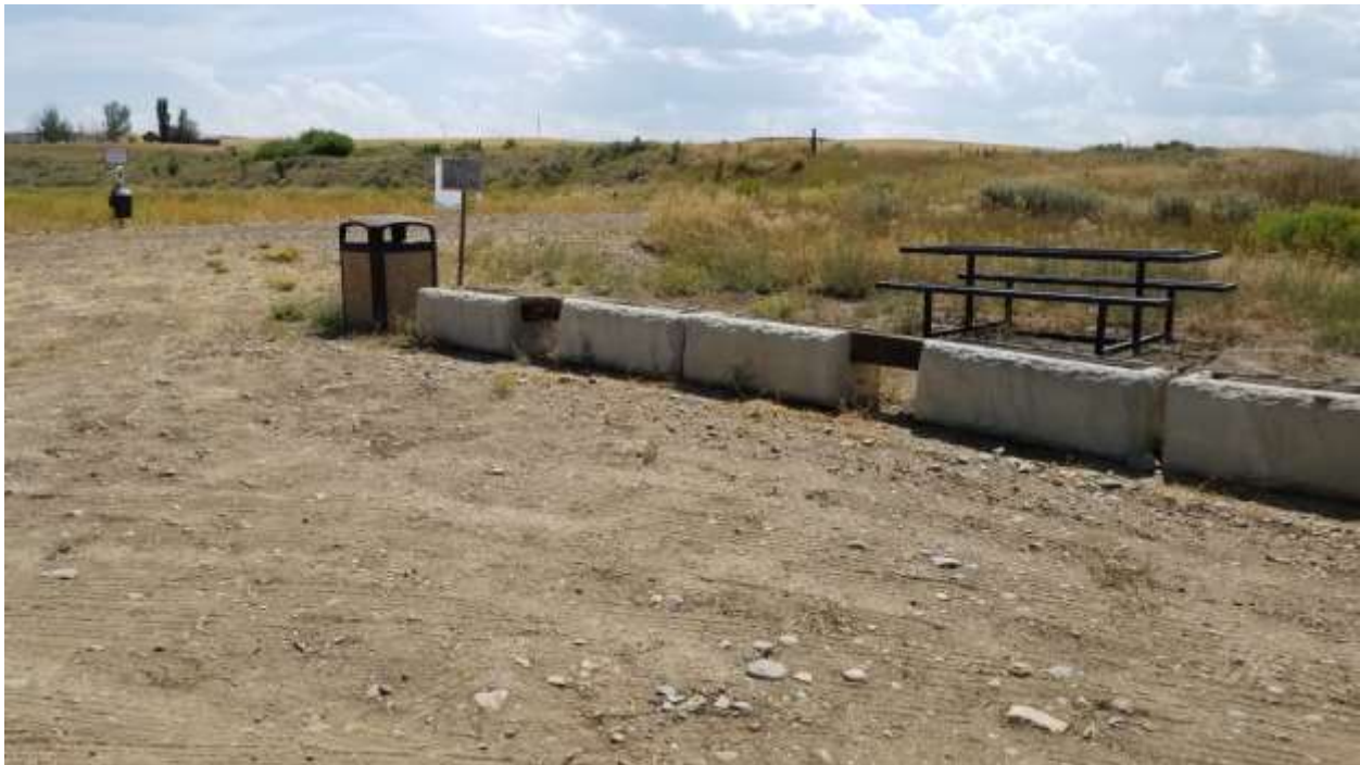
Main trailhead/parking lot

Number of Partial Inspection this Fiscal Year: 2