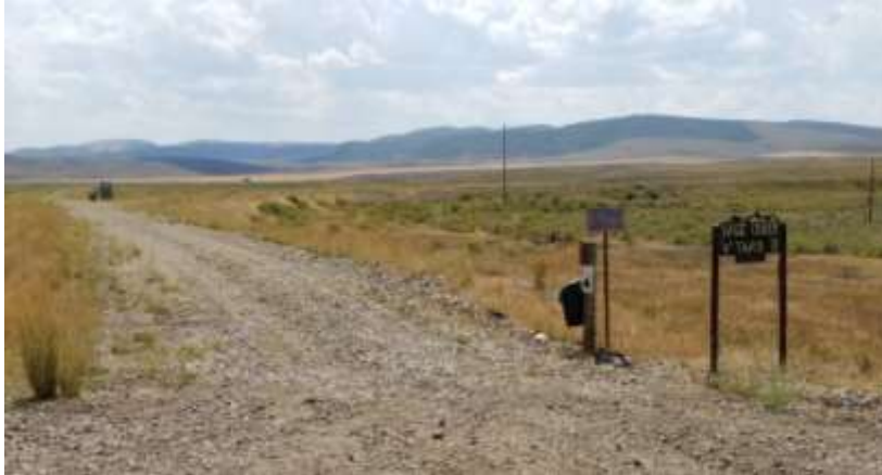
Facing south down the rail loop