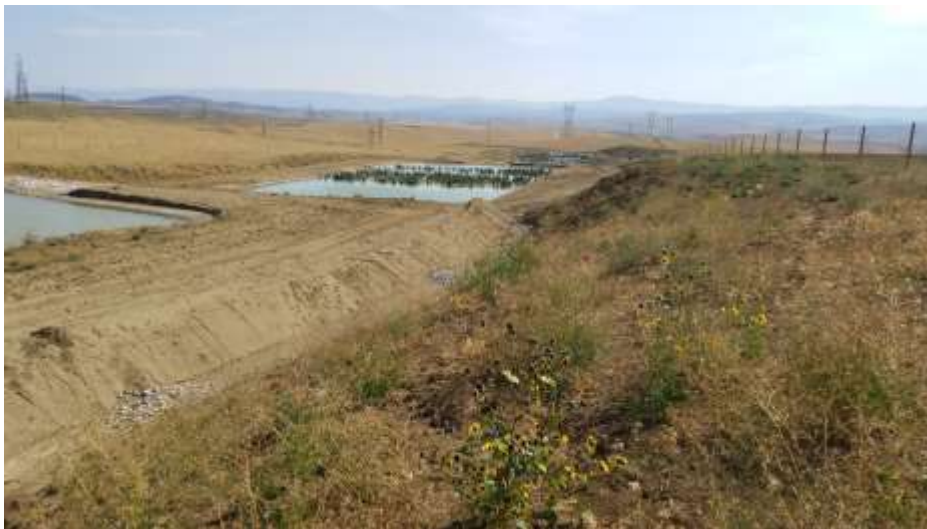
Slopes of passive treatment ponds need to be reseeded.

Number of Partial Inspection this Fiscal Year: 2