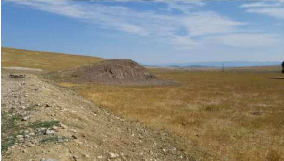
12 Left pad slopes and Topsoil pile need to be reseeded and stabilized.