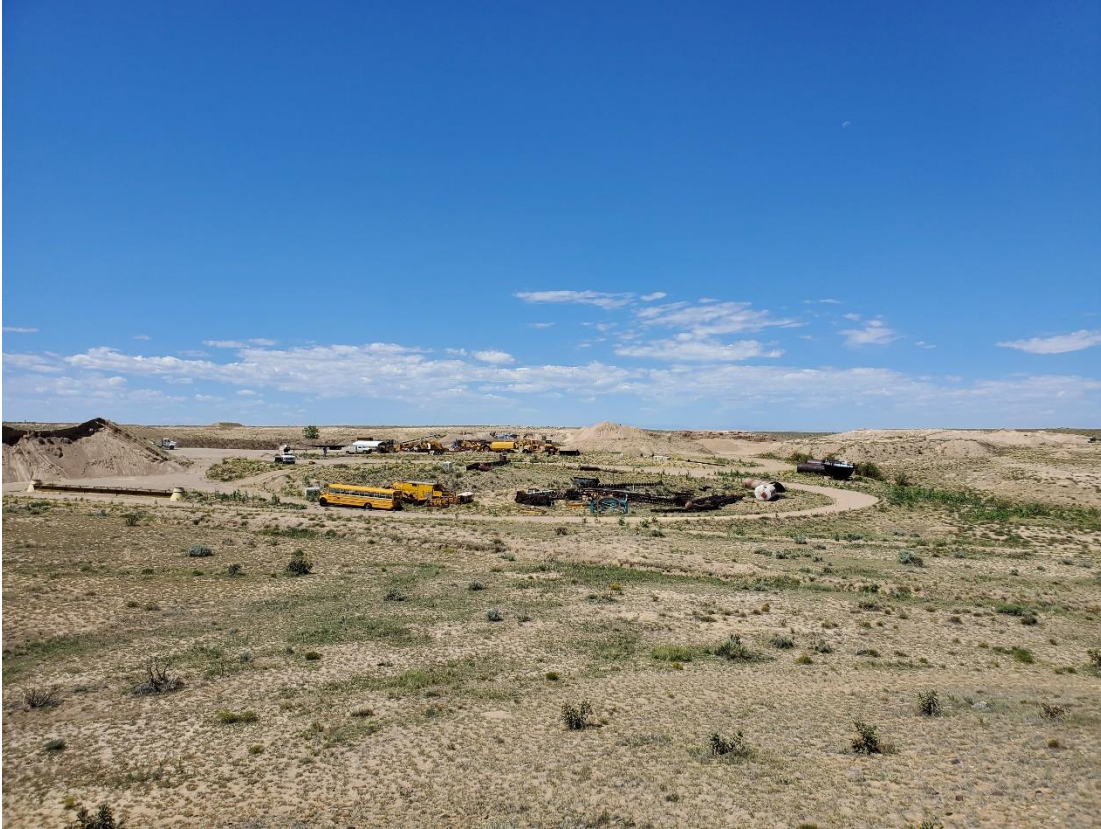
Overlooking area 1 and some of the revegetation area