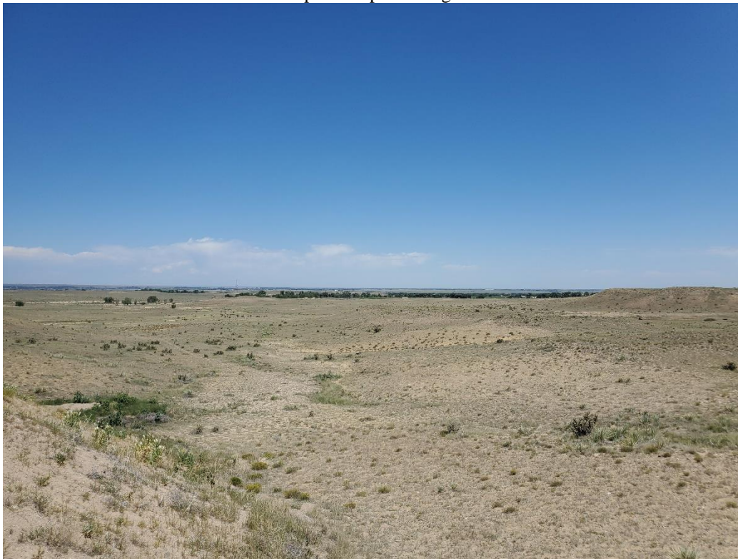
Overlooking revegetation area