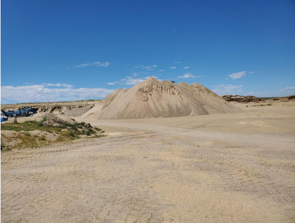
Stockpile and processing area