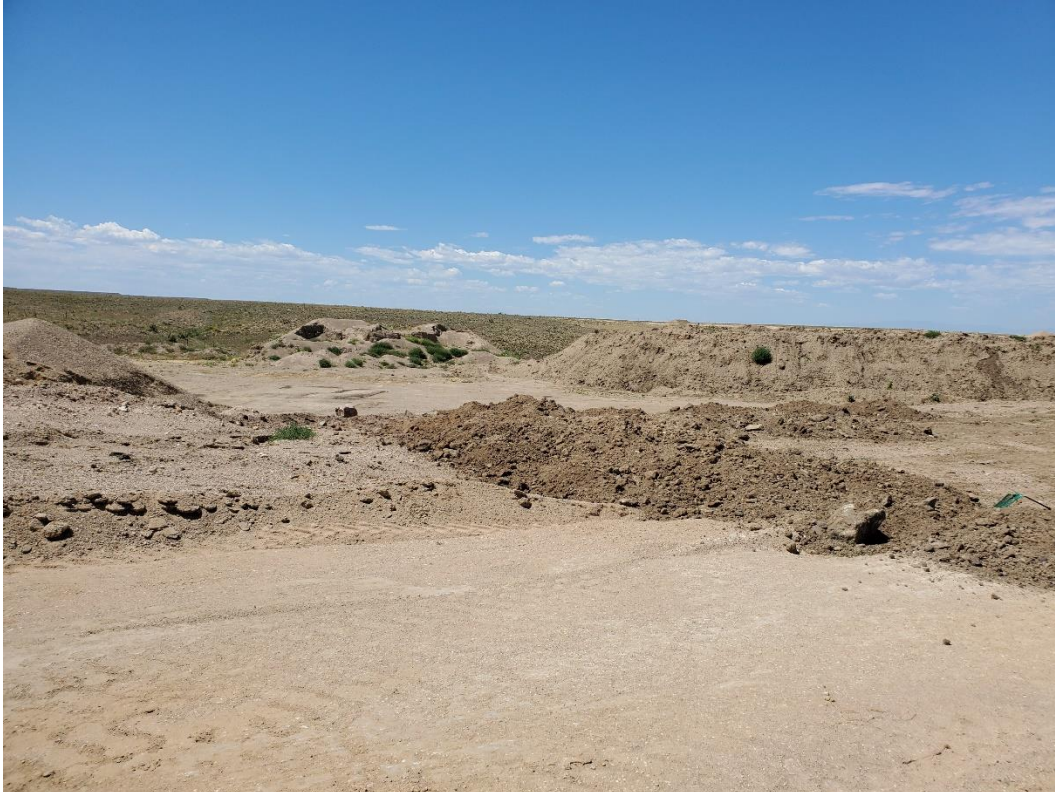
Topsoil being laid down for reclamation