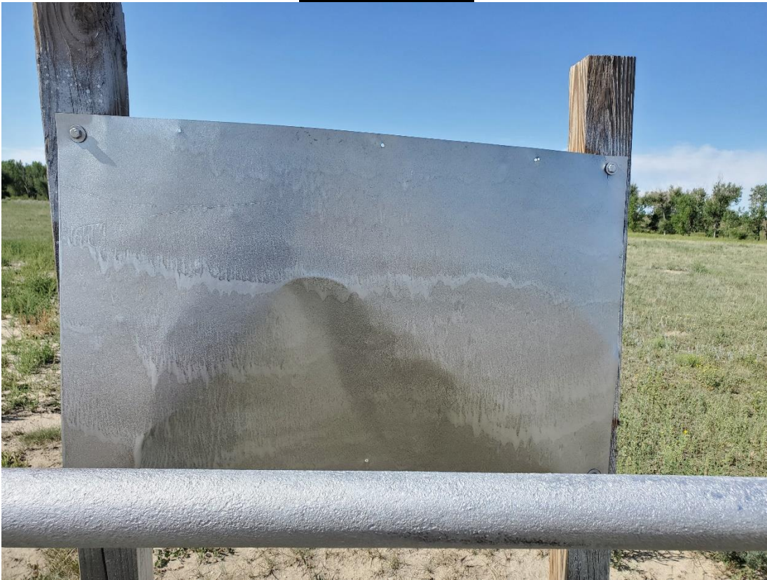
Where the Entrance Sign Should be