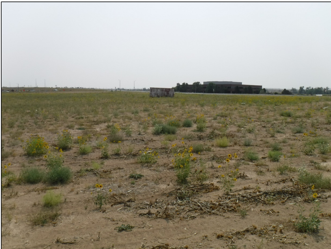
Photo 4: Looking to the southeastern corner of site from the west side of site