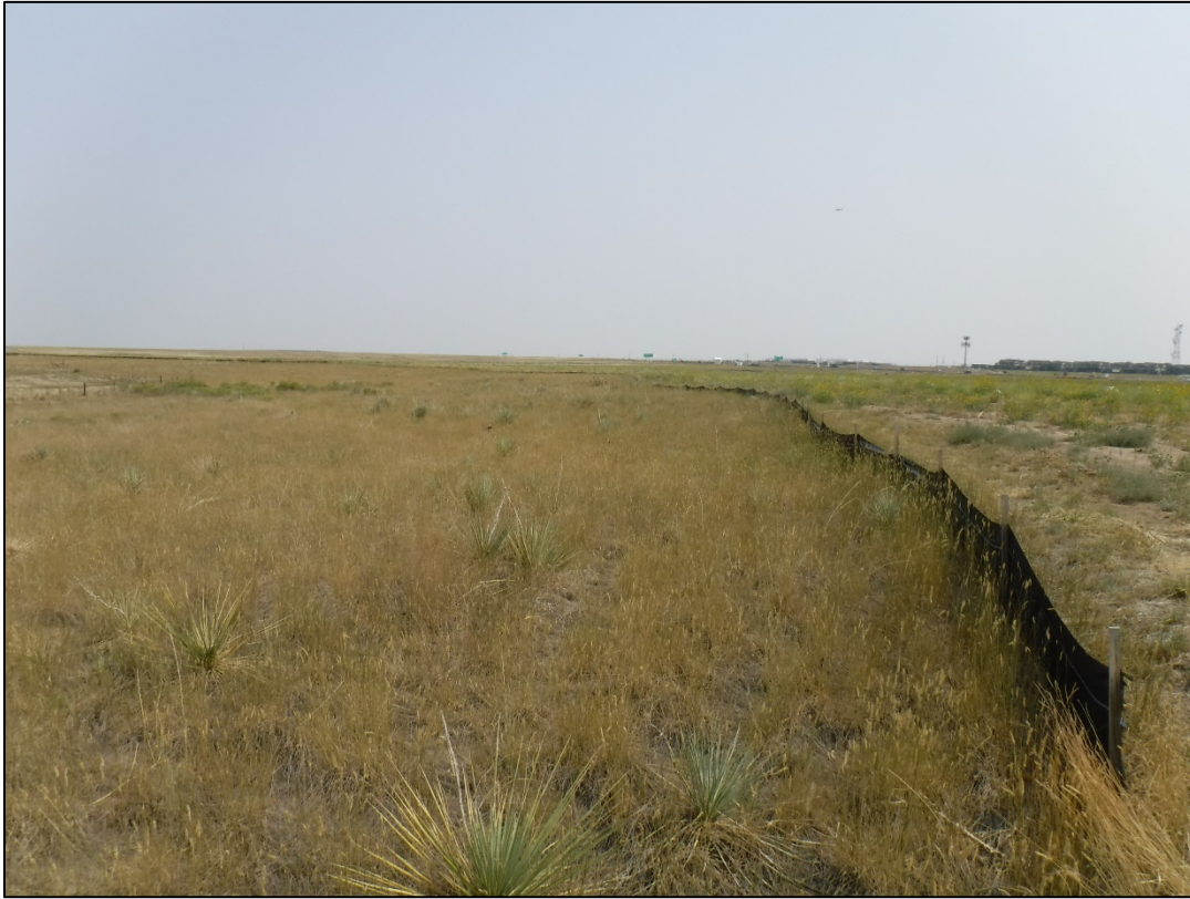
Photo 3: Western portion of site, mined area to the right of the silt fence