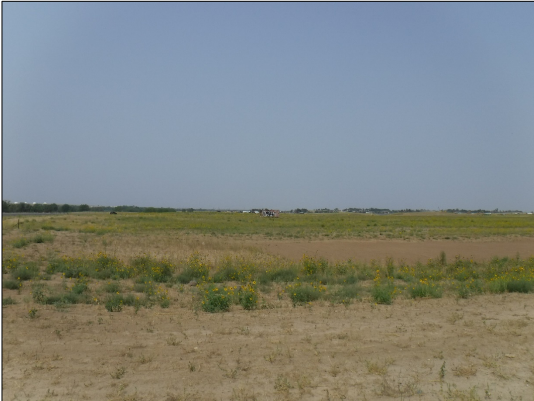
Photo 1: Looking west across southern portion of site near the intersection of 6 th Ave and Valdai St