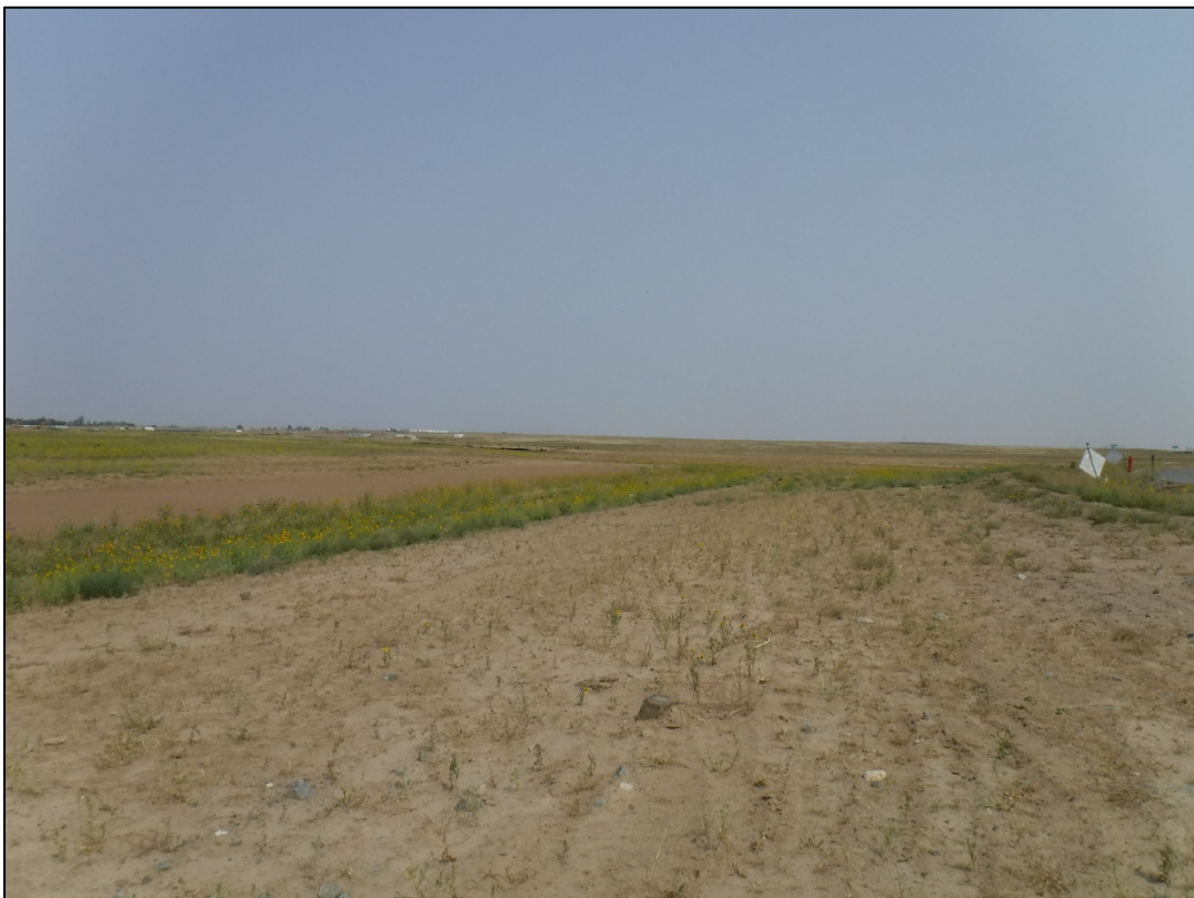
Photo 2: Looking north along eastern portion of site near the intersection of 6 th Ave and Valdai St