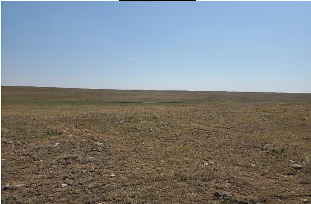
Pond found on the permit site