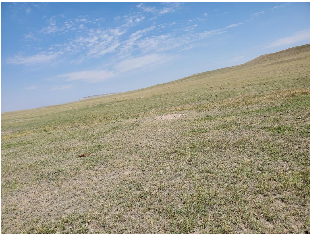
Permit facing South