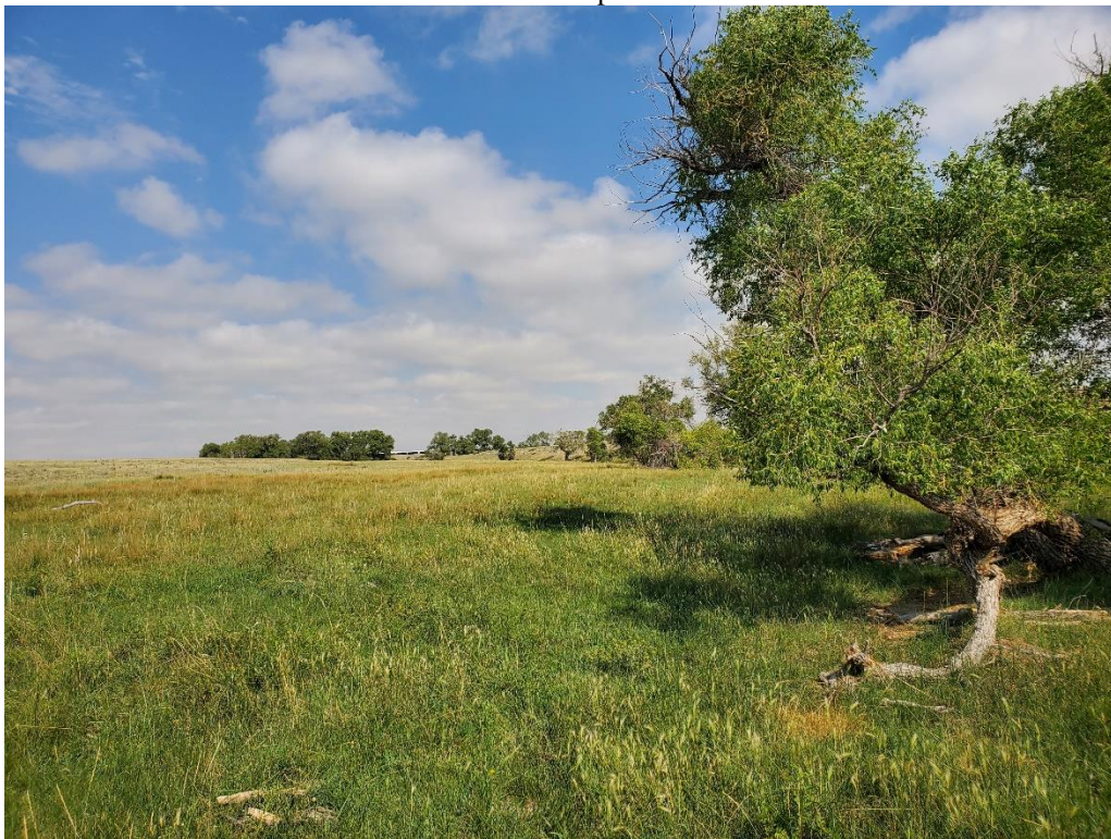
Permit facing West