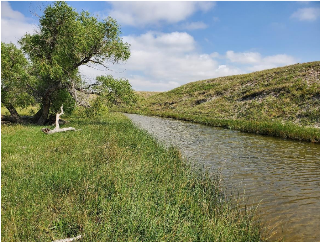
River on the permit