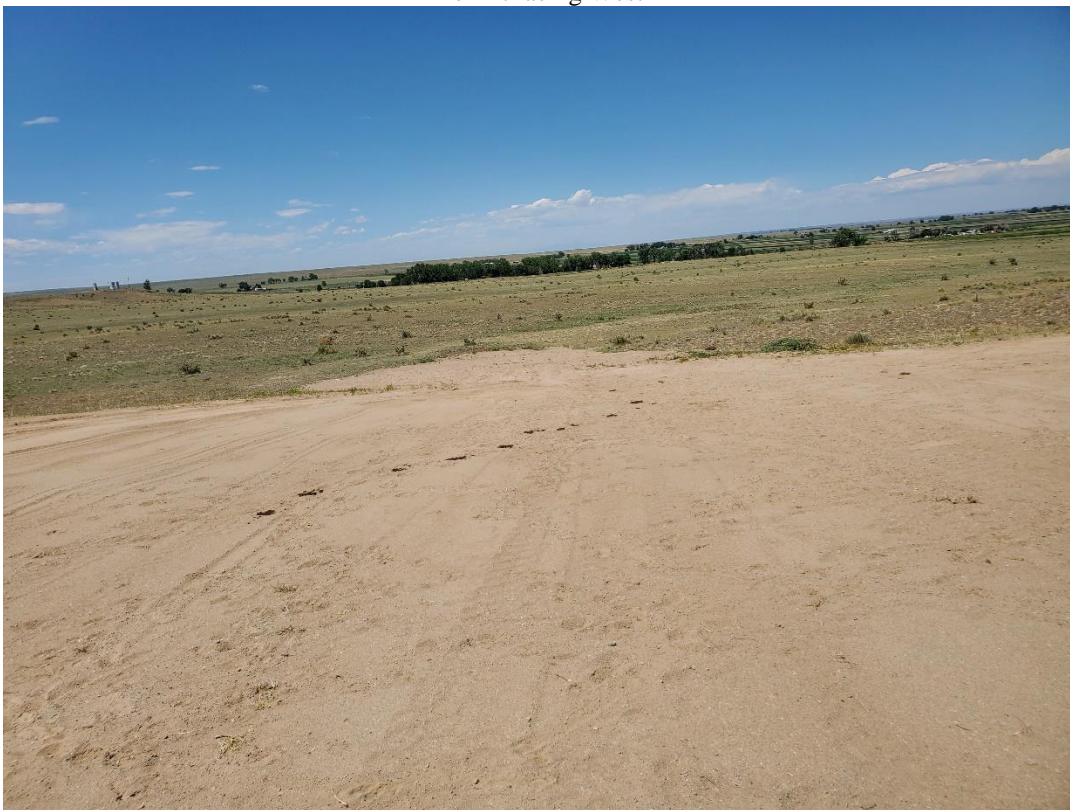
Barren area on permit