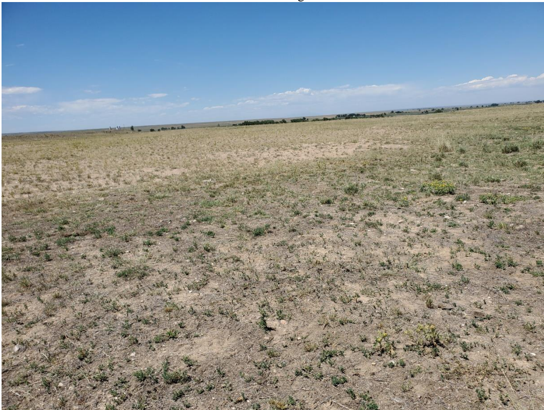
Permit facing South