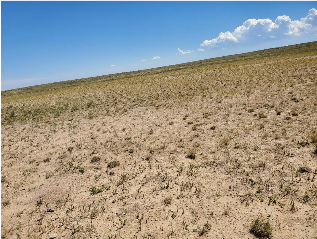
Permit facing West