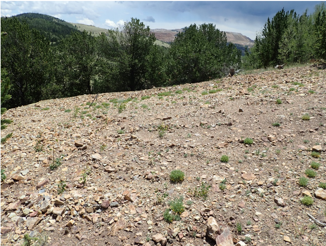
Photo 2. Backfilled and graded test pit within historic disturbance; looking southeast.