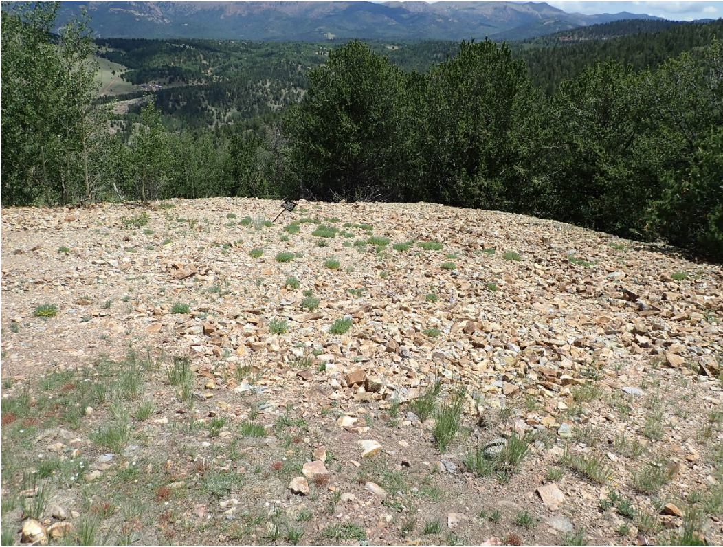
Photo 1. Backfilled and graded test pit within historic disturbance; looking east.