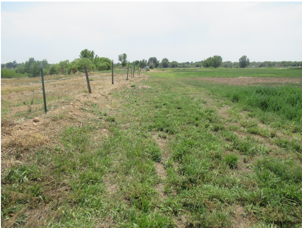
View of the former conveyor corridor from the north end looking south