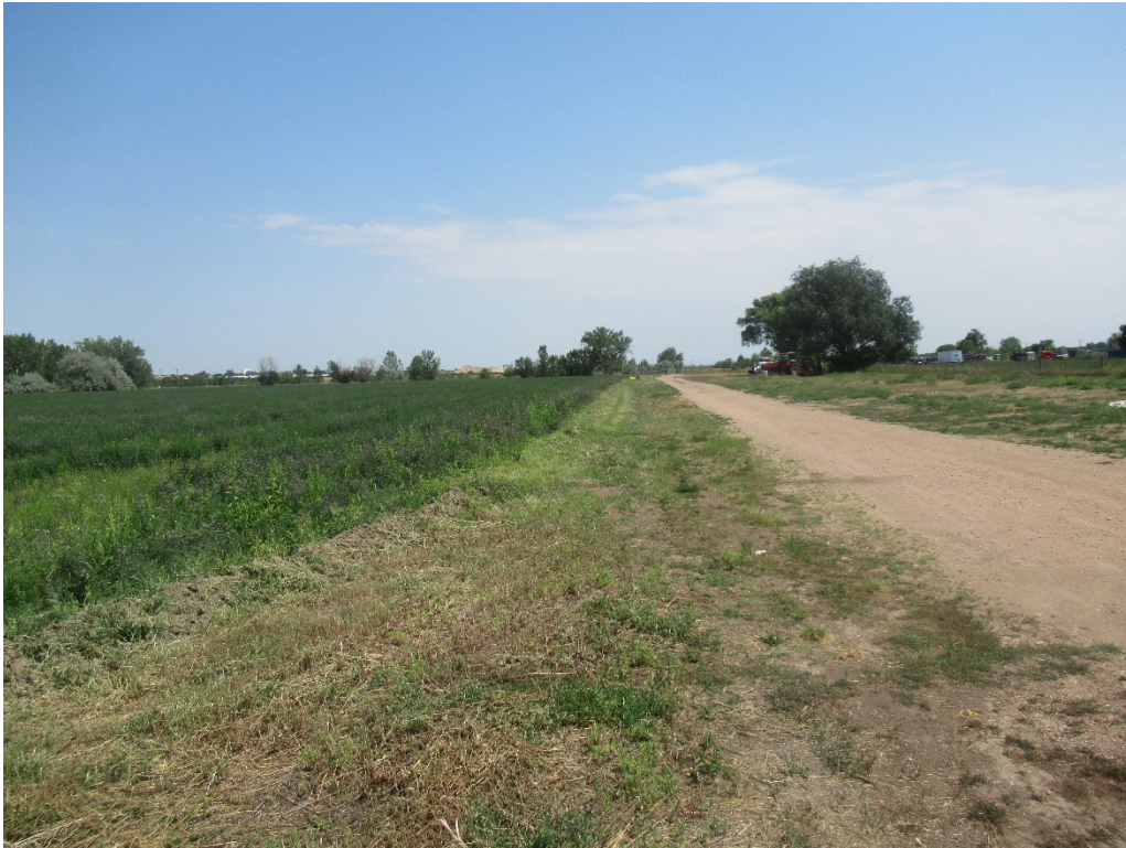
View of the former conveyor corridor from the southwest end looking east