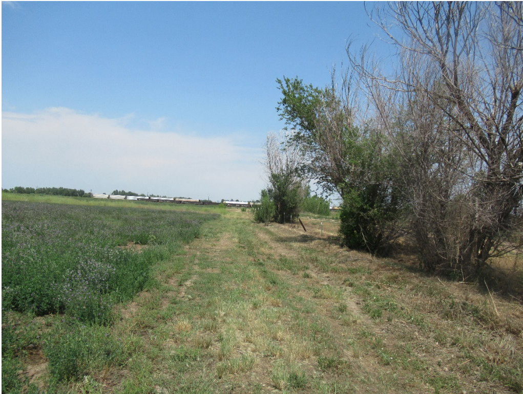
View of the former conveyor corridor from the southeast corner looking north