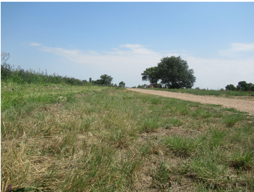
View of typical vegetation in the former conveyor corridor