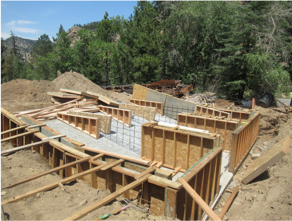
View of the sediment containment structure construction from the southeast corner looking northwest