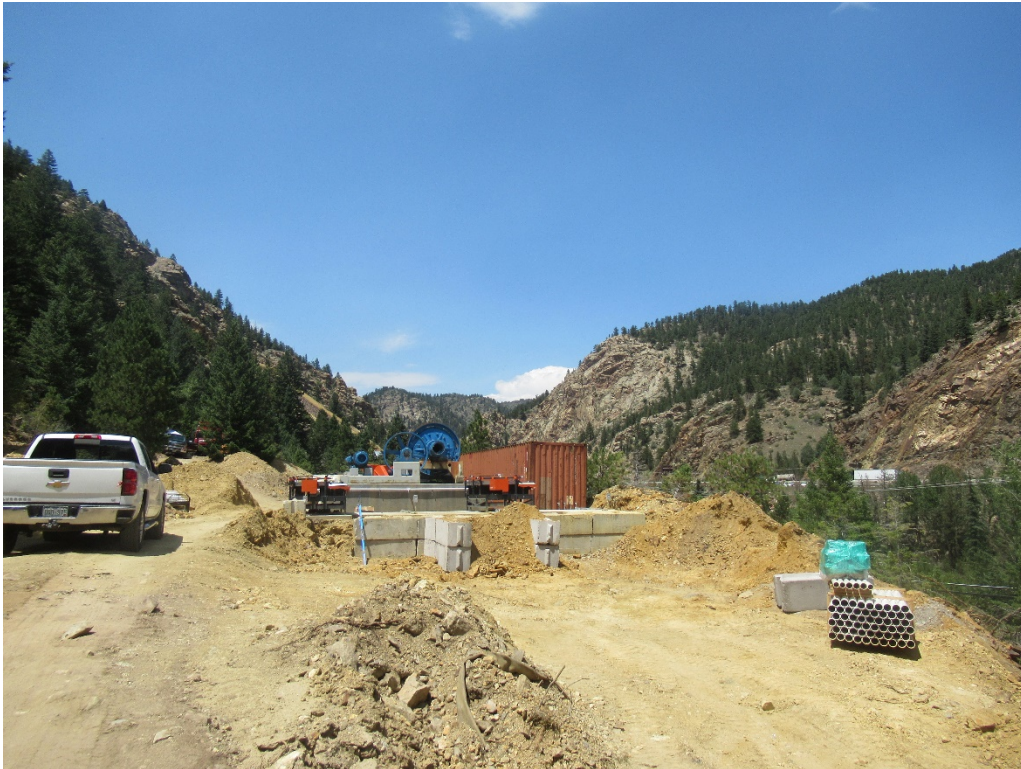
View of the ball mill construction from the east side of the facility looking west