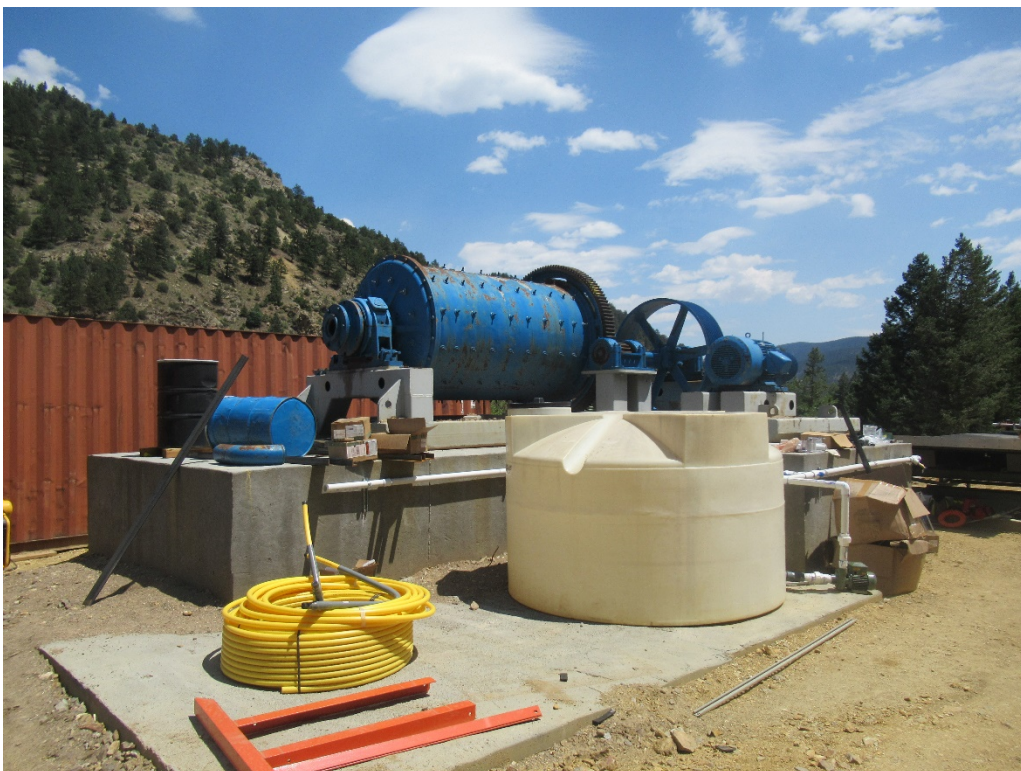
View of the ball mill construction from the southwest side of the facility looking northeast