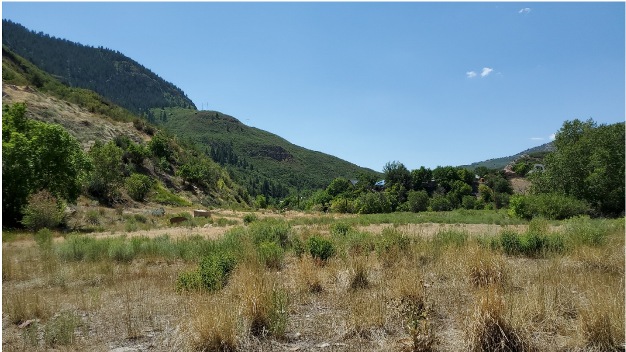
Figure 1: Overview of site from east