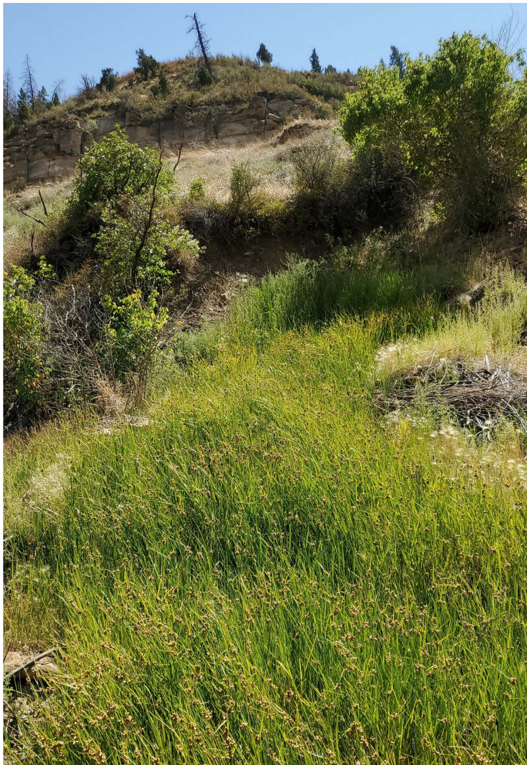
Figure 3: Sedges in channel below seep

Number of Partial Inspection this Fiscal Year: 1