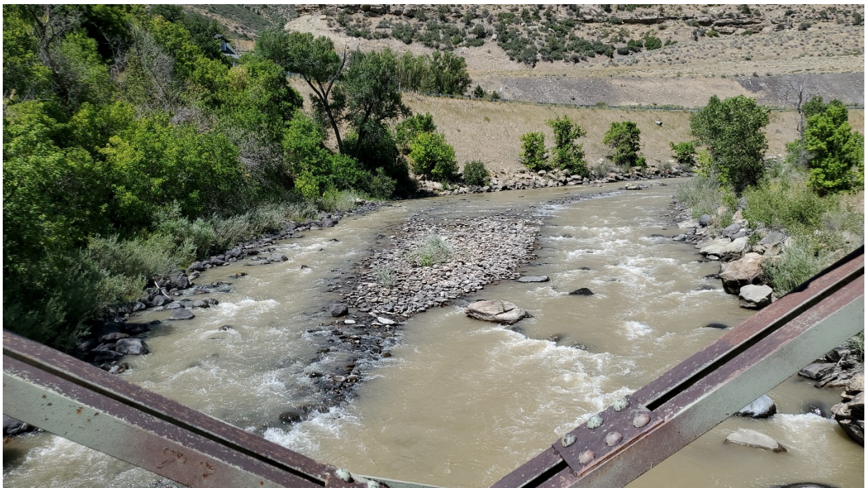
Figure 2: North Fork of the Gunnison

Number of Partial Inspection this Fiscal Year: 1