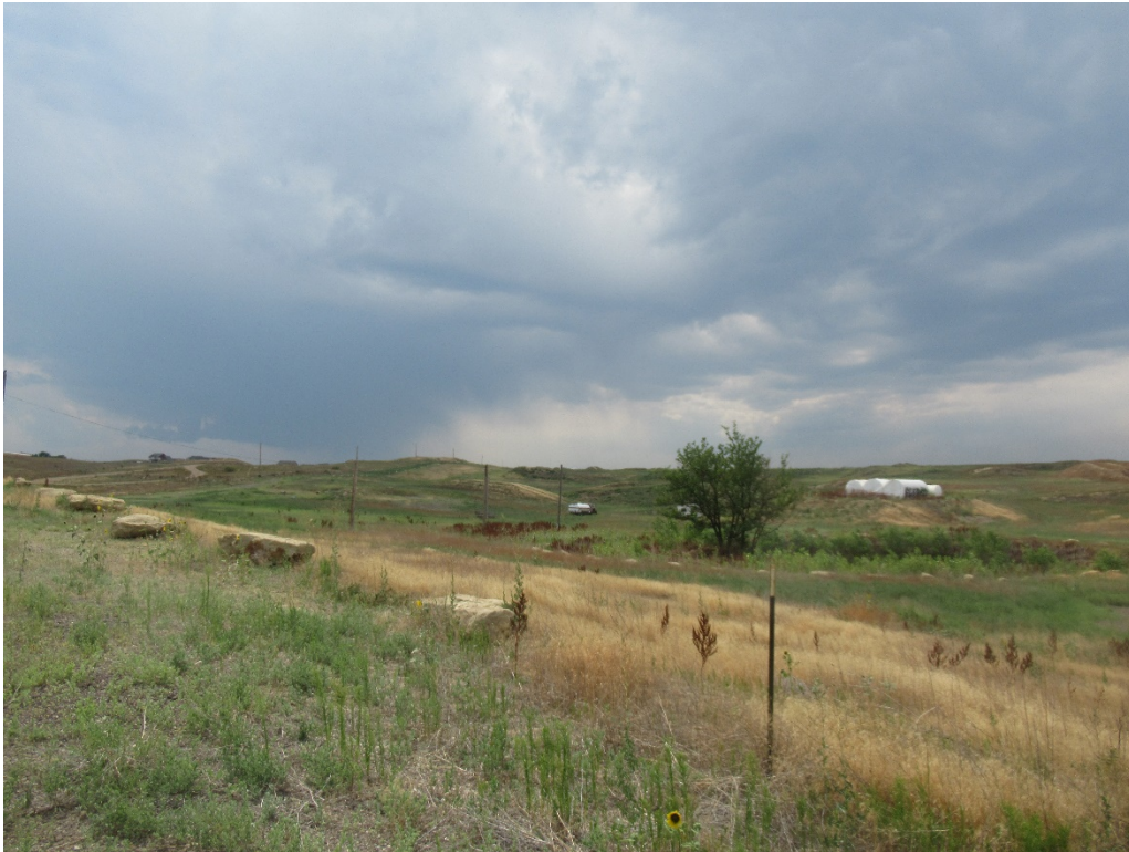
View of the site from the track gate looking northwest