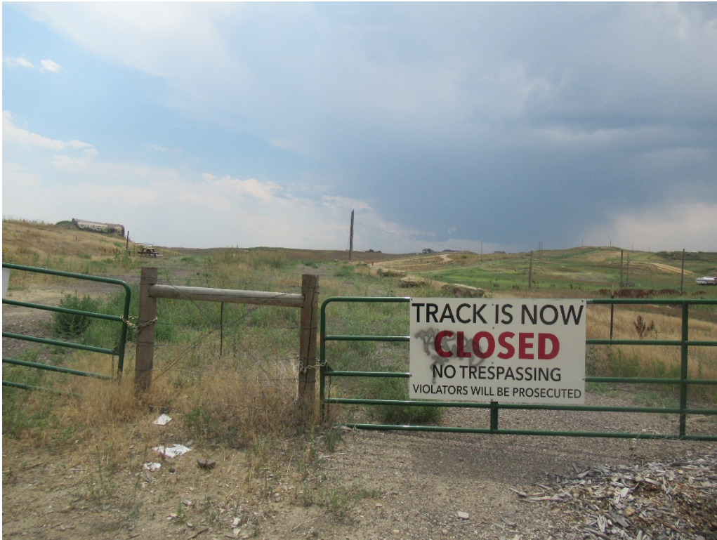
View of the locked gate off of the I-25 Frontage Road