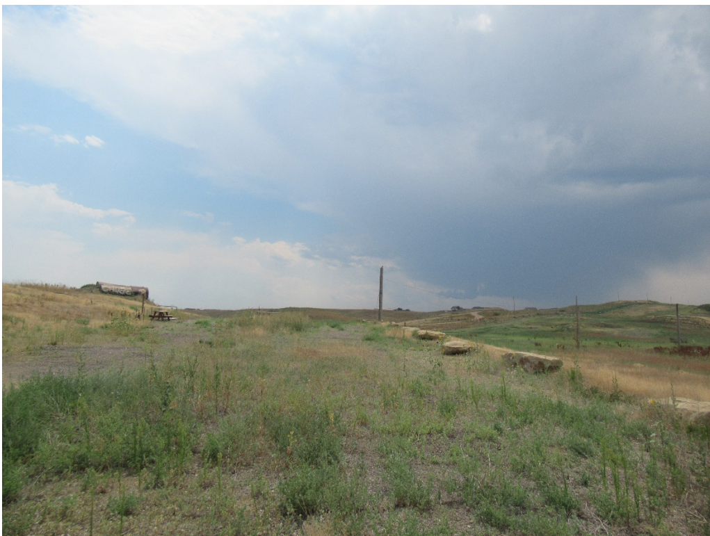
View of the site from the track gate looking west