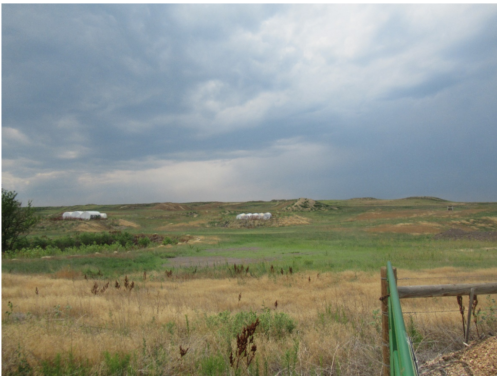
View of the site from the track gate looking north