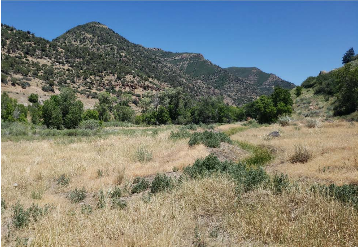
Figure 2: Overview of site

Number of Partial Inspection this Fiscal Year: 1