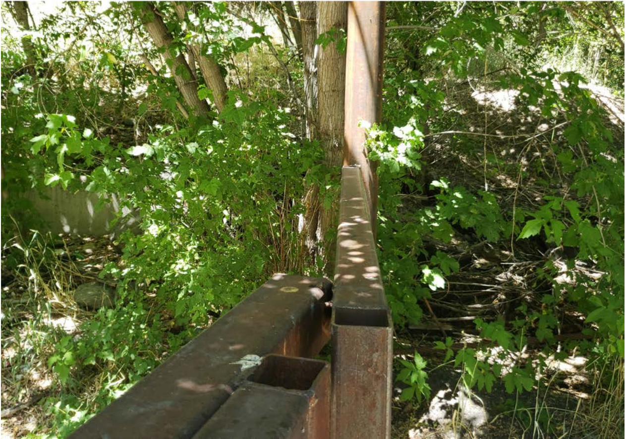
Figure 1: Access gate

Number of Partial Inspection this Fiscal Year: 1