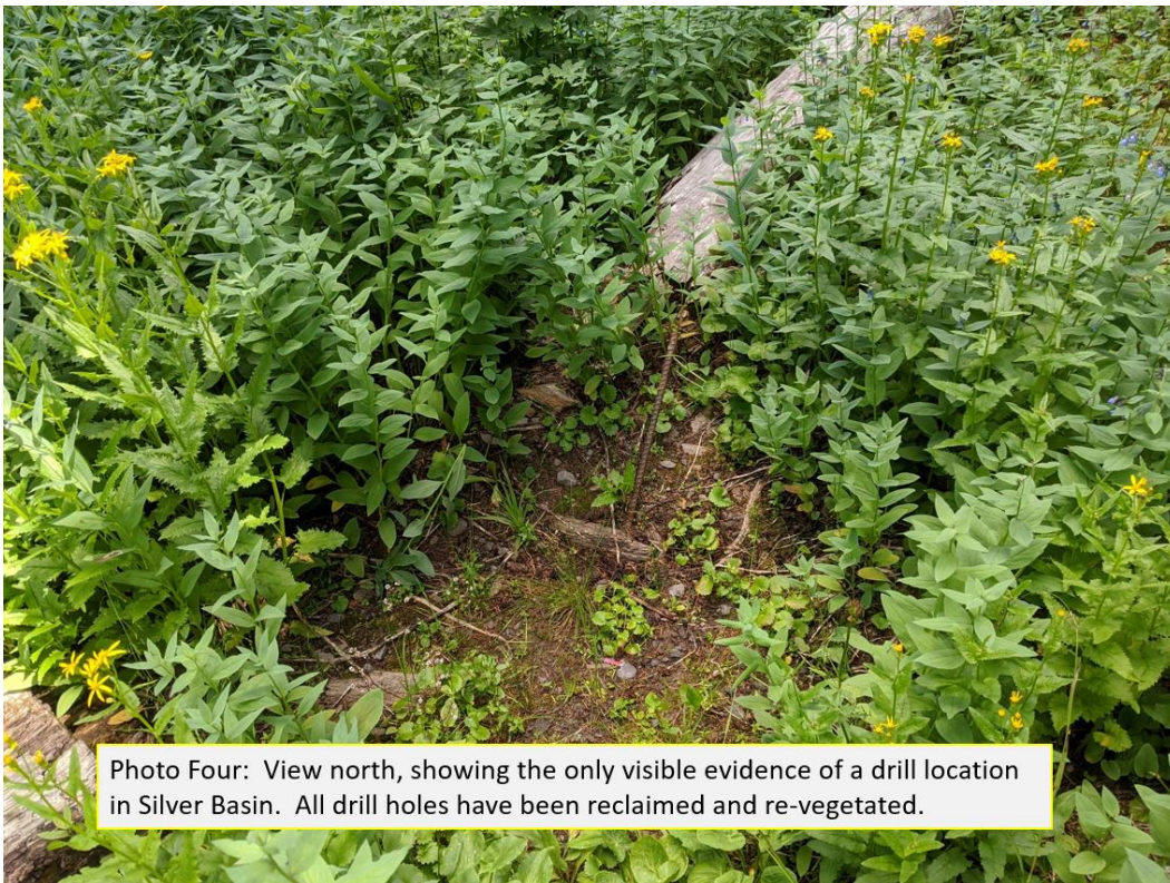
Photo Four: View north, showing the only visible evidence of a drill location in Silver Basin. All drill holes have been reclaimed and re-vegetated.