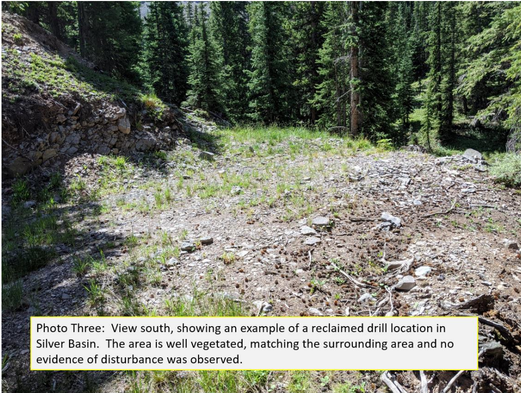
Photo Three: View south, showing an example of a reclaimed drill location in Silver Basin. The area is well vegetated, matching the surrounding area and no evidence of disturbance was observed.