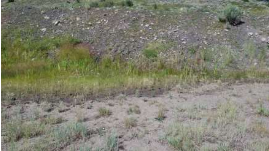
Saturated area between road and lower sump