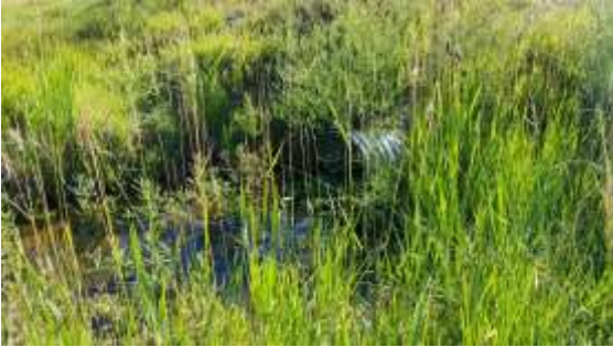
Site 7 outlet of culvert