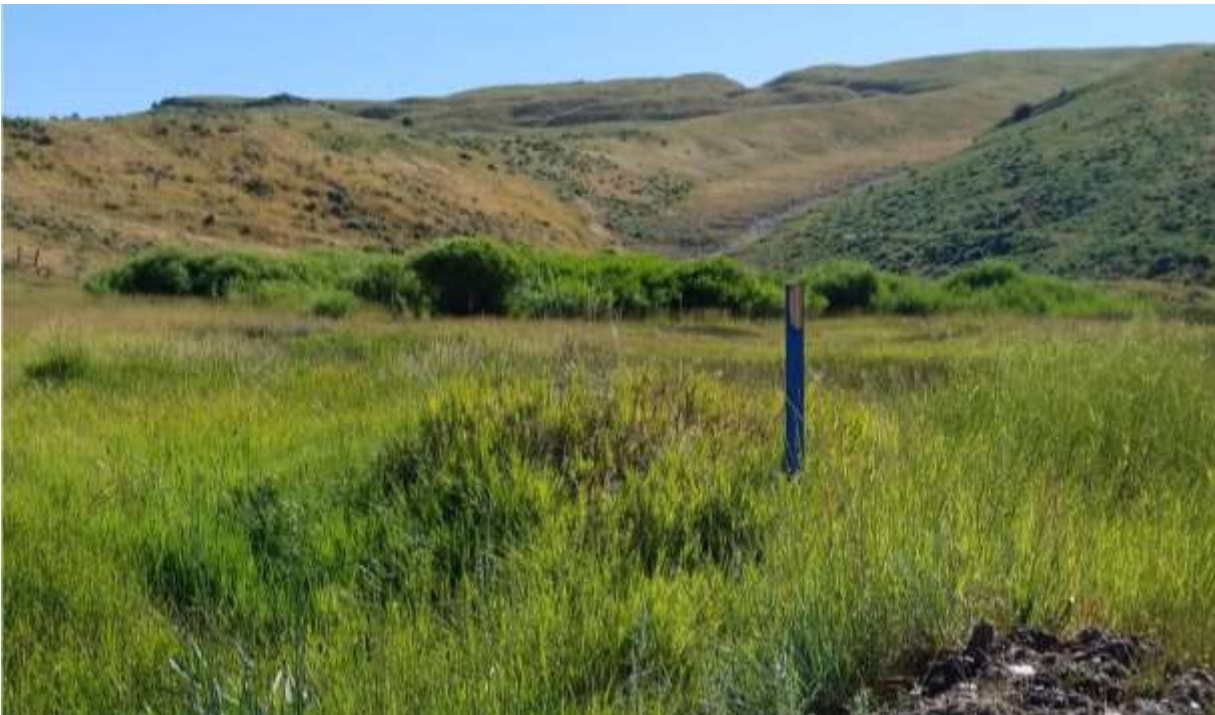
Willow patch up from Site 7