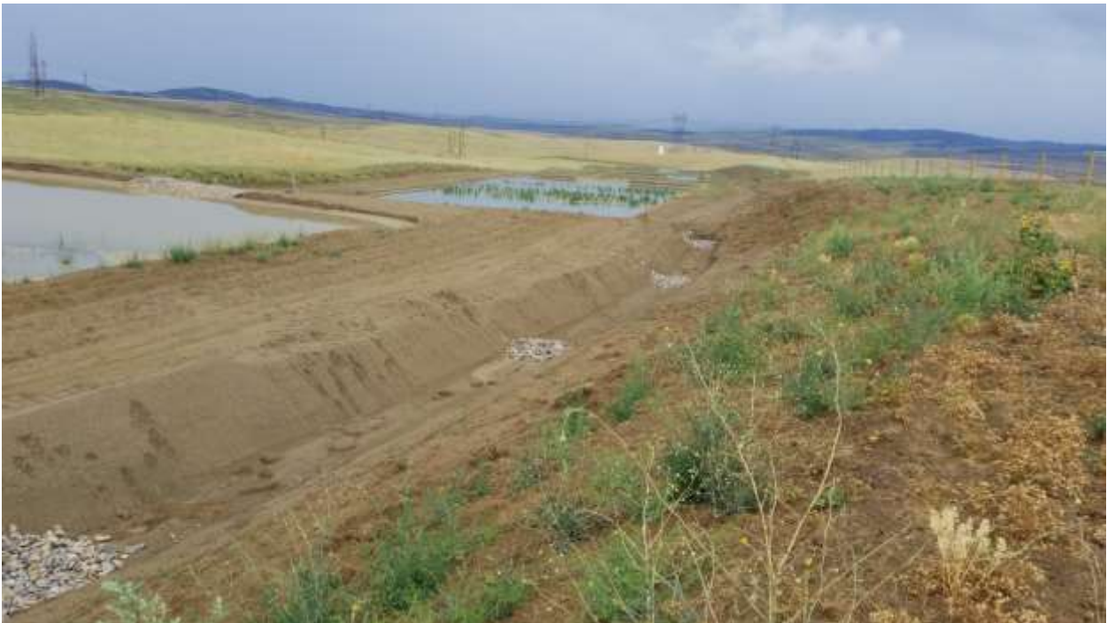
Passive treatment ponds

Number of Partial Inspection this Fiscal Year: 3