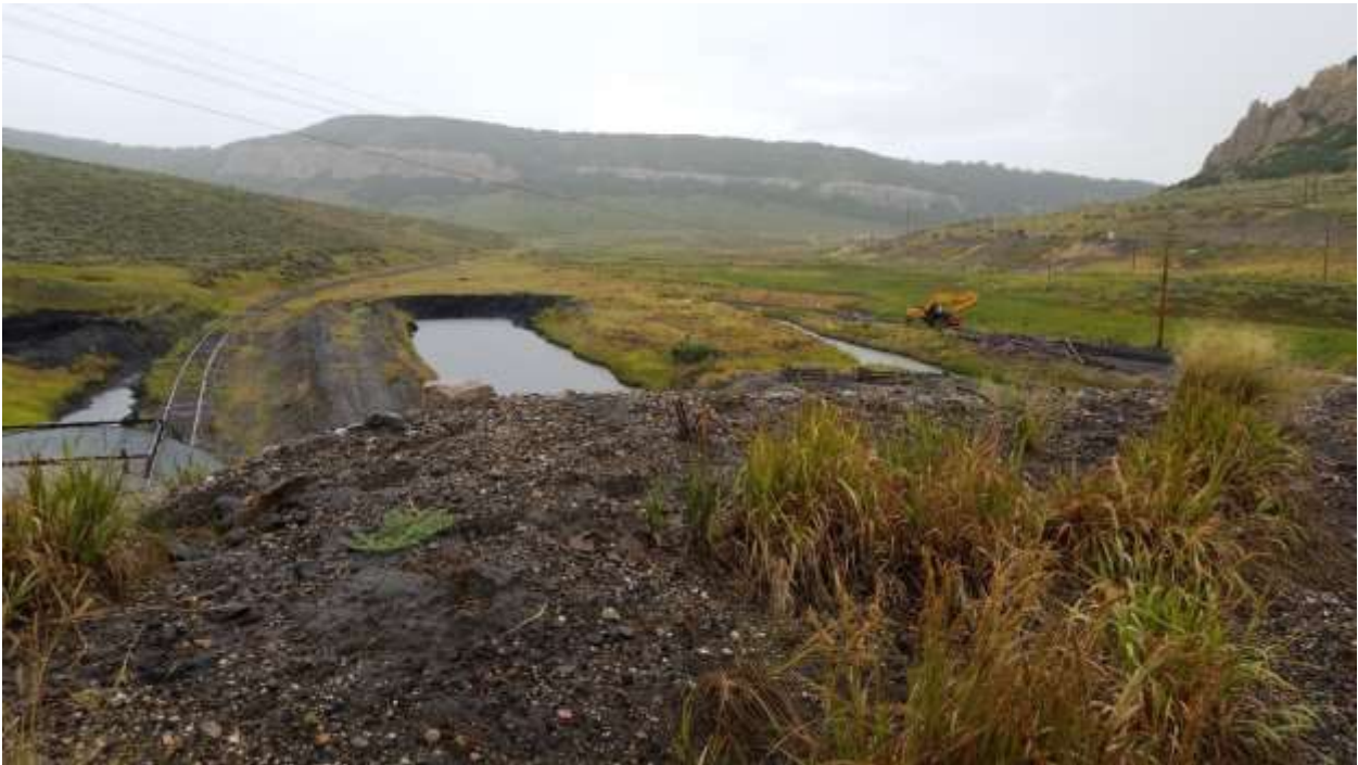
Long arm at Pond B