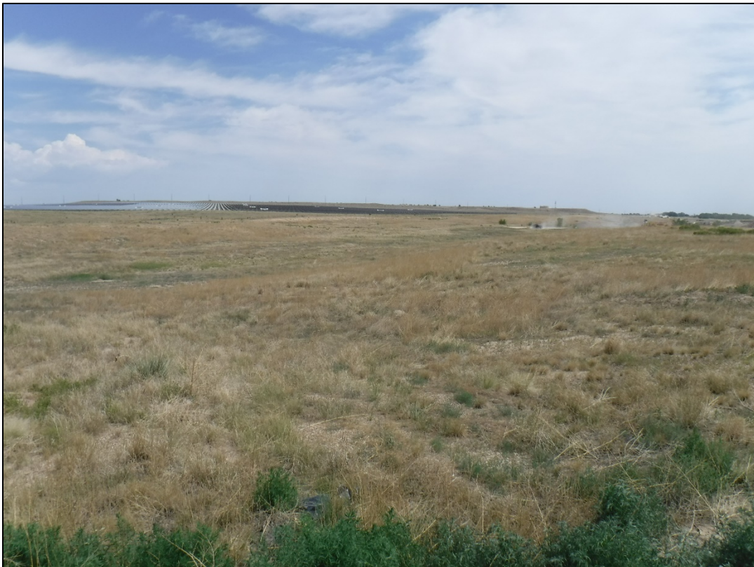
Photo 4: Looking north across the southern parcel, dust from main processing area