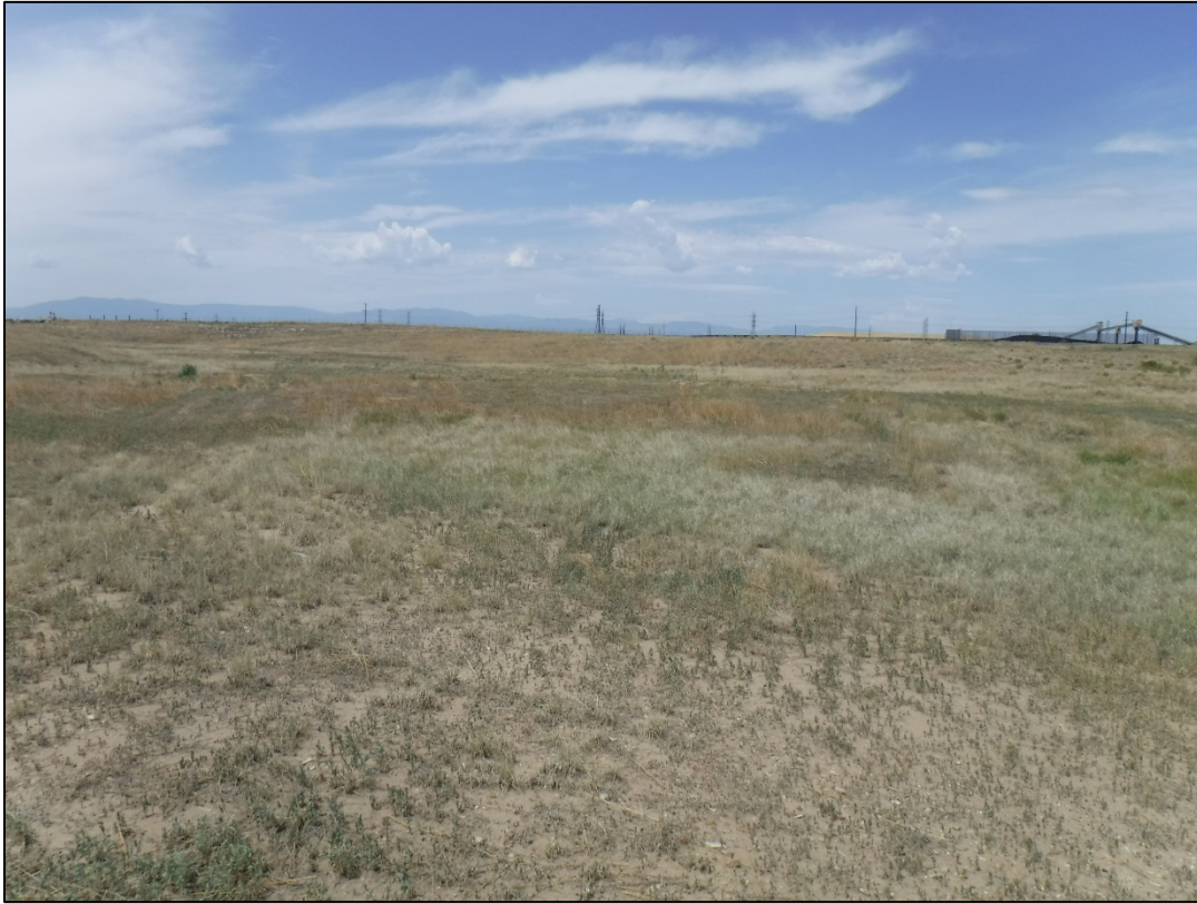
Photo 5: Looking west towards St. Charles Mesa Rd from the middle of release area