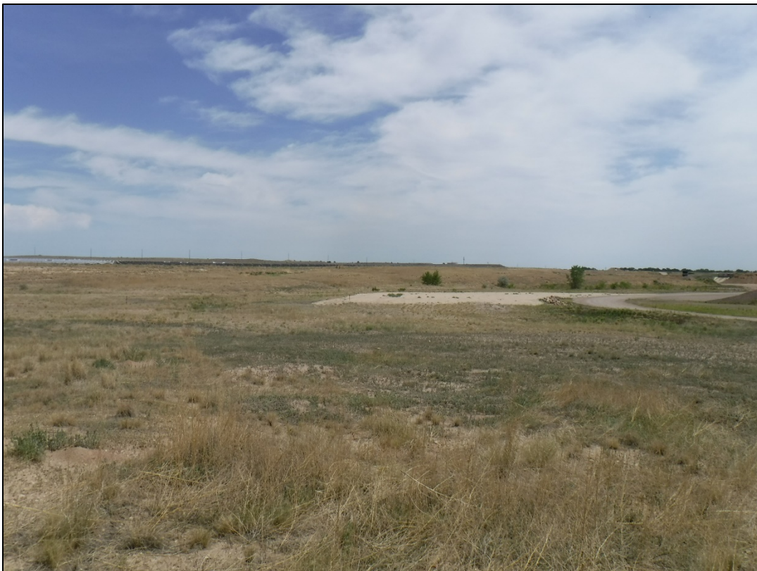
Photo 6: Looking north from middle of release area, bare patch of landed excluded from release request