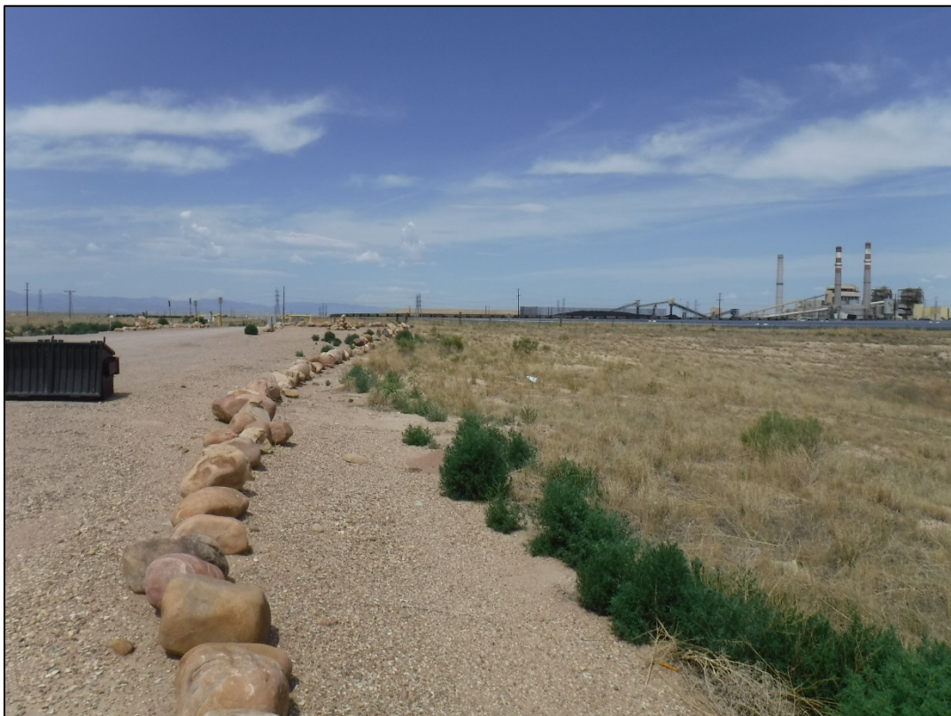
Photo 2: Southern-most boundary of the south parcel, scale house to left of picture