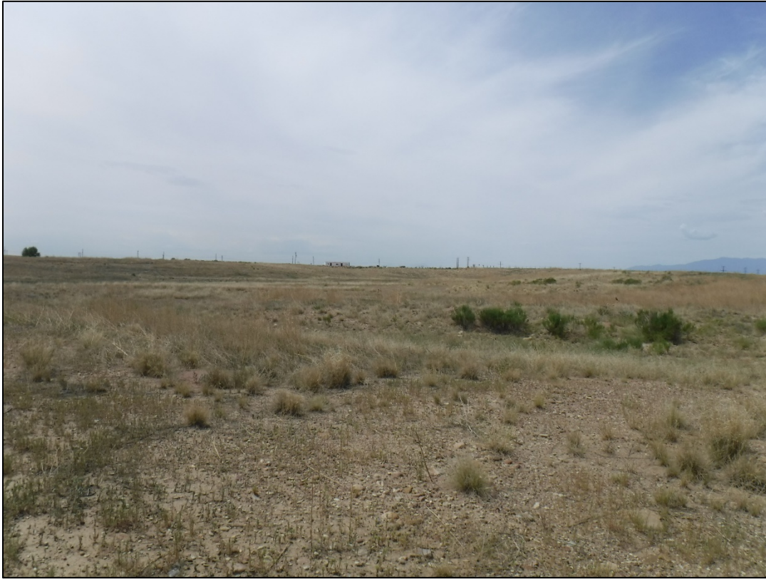
Photo 7: Looking south across release request from northern portion of area