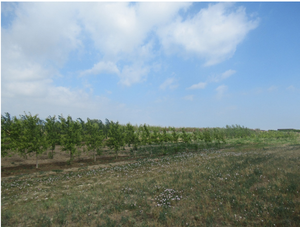
View of the West Pit from the southeast corner of the pit looking northwest