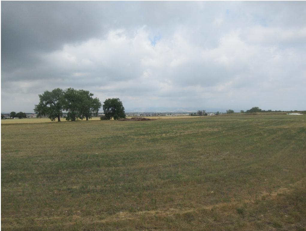
View of the East Pit from the northeast corner of the pit looking southwest