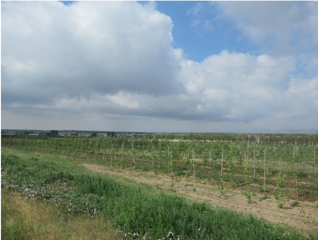
View of the West Pit from the northeast corner of the pit looking southwest