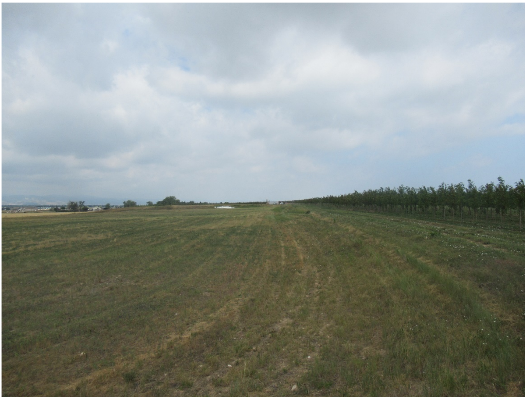
View of the East Pit from the northeast corner of the pit looking west