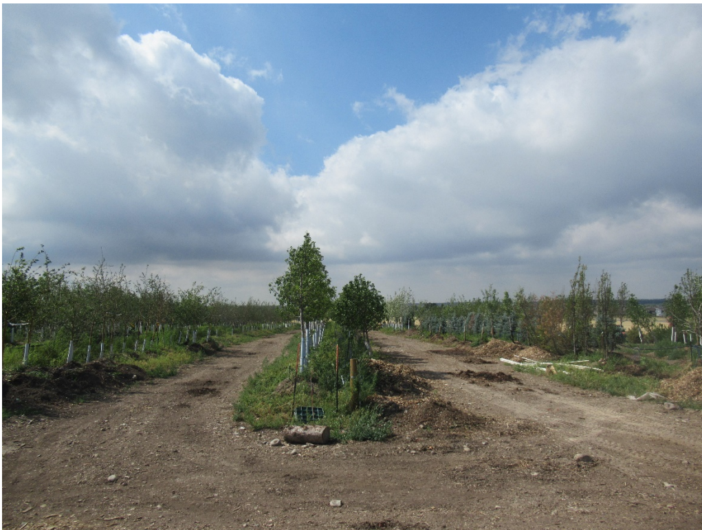
View of the West Pit from the north side of the pit looking south