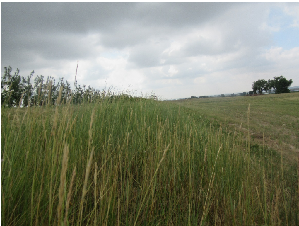
View of the vegetation on the north slope of the East Pit looking east