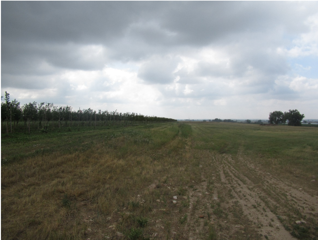
View of the East Pit from the northwest corner of the pit looking east