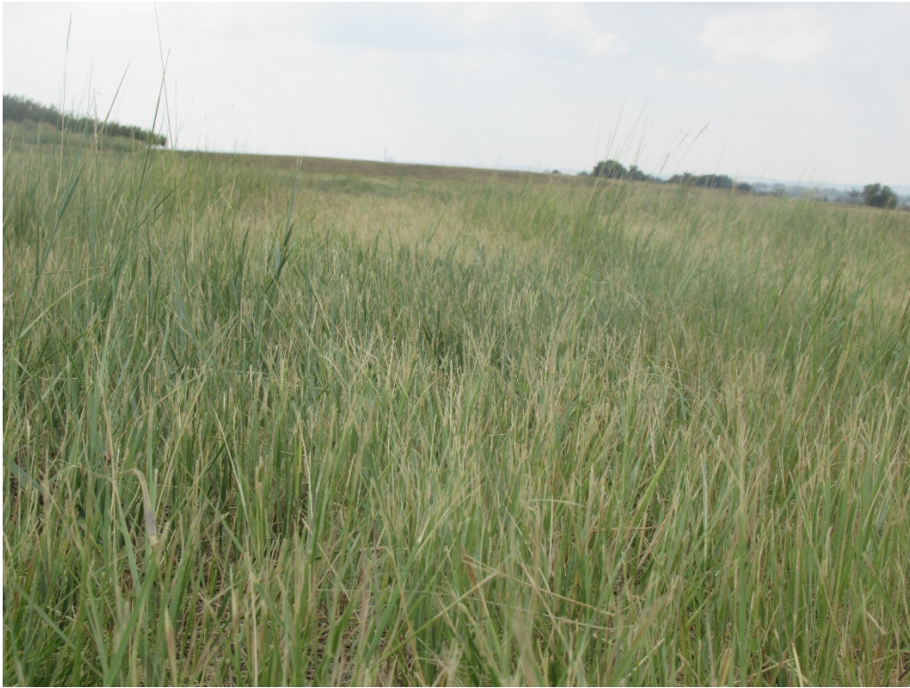
View of the vegetation on the pit floor of the East Pit