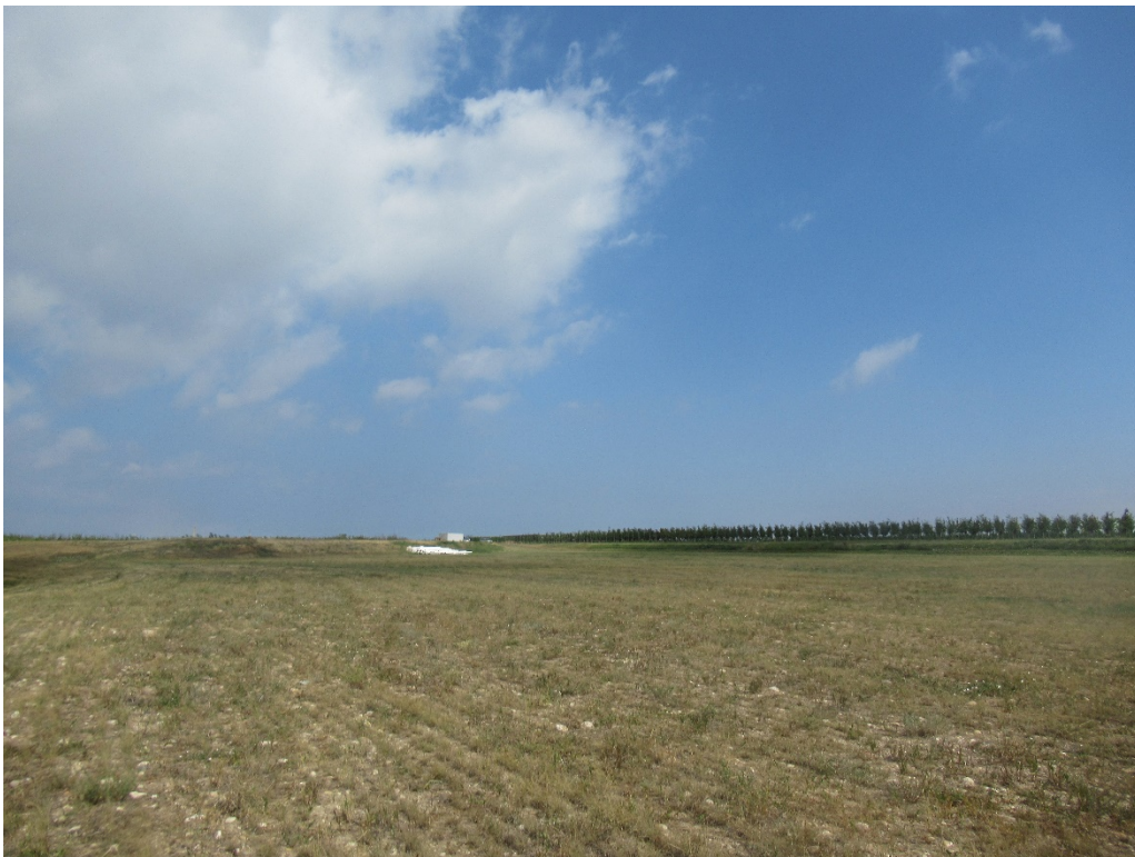
View of the western portion of Phase 1 looking west