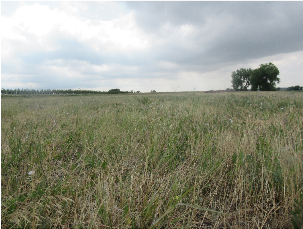
View of the vegetation on the pit floor of Phase 1 looking west