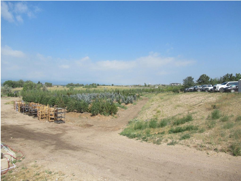
View of Phase 3 from the northeast corner of the phase looking northwest