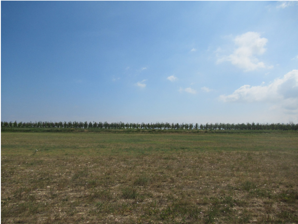
View of Phase 1 from the south side looking north