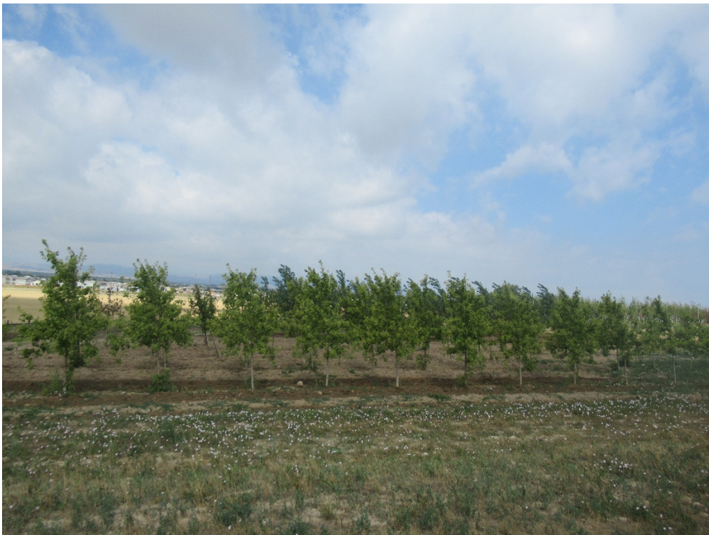
View of Phase 2 from the northeast corner of the phase looking west