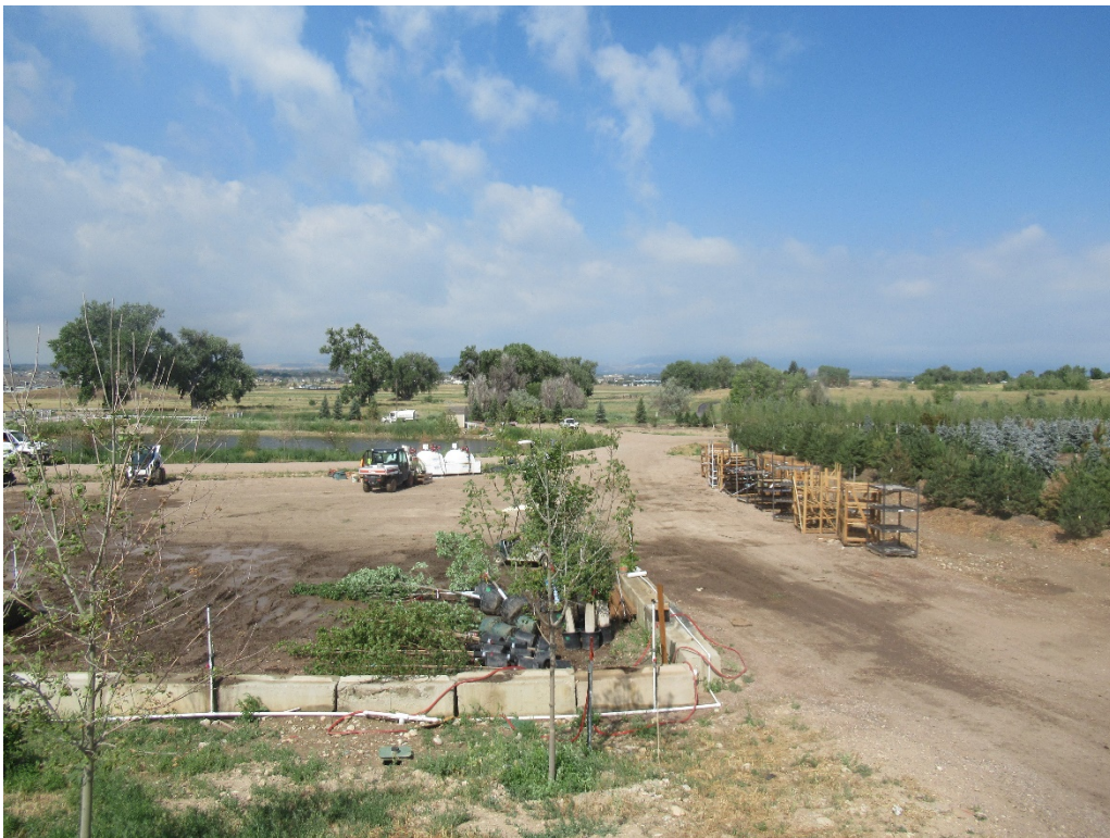
View of Phase 3 from the northeast corner of the phase looking west