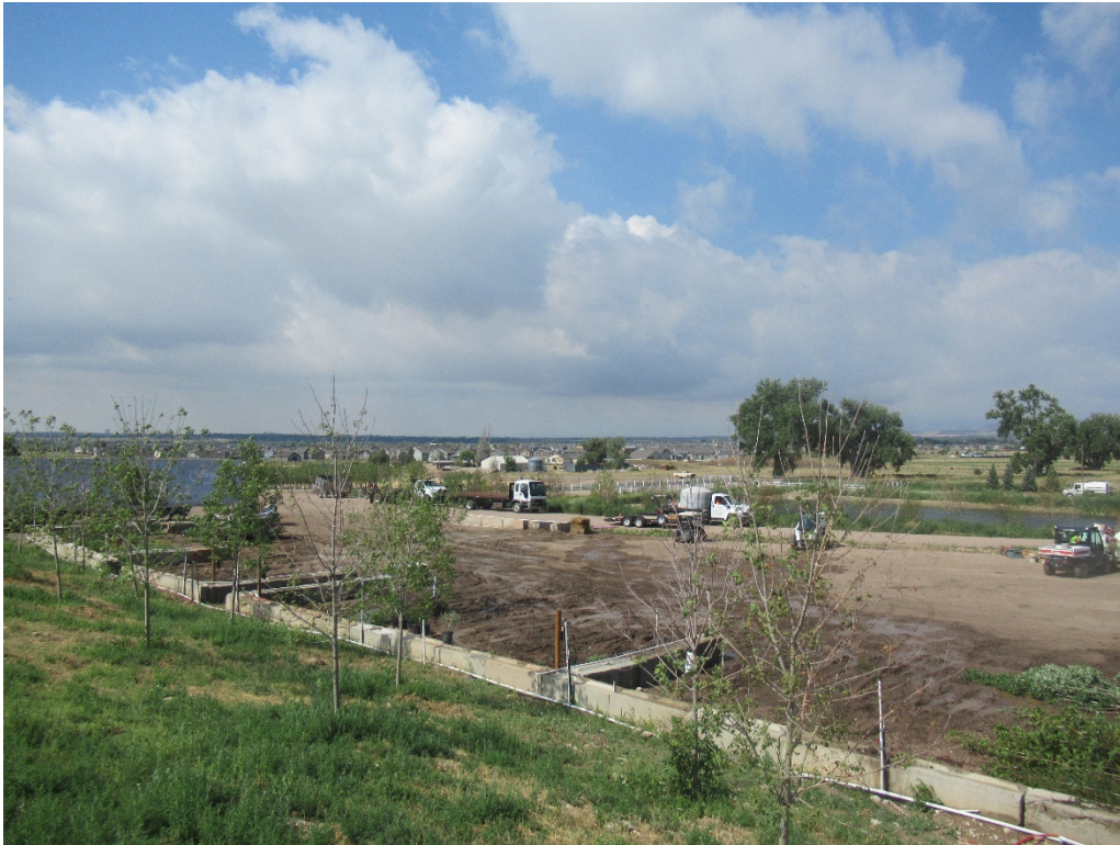
View of Phase 3 from the northeast corner of the phase looking southwest

Kevin Anderson Connell Resources, Inc. 7785 Highland Meadows Parkway Fort Collins, CO 80528