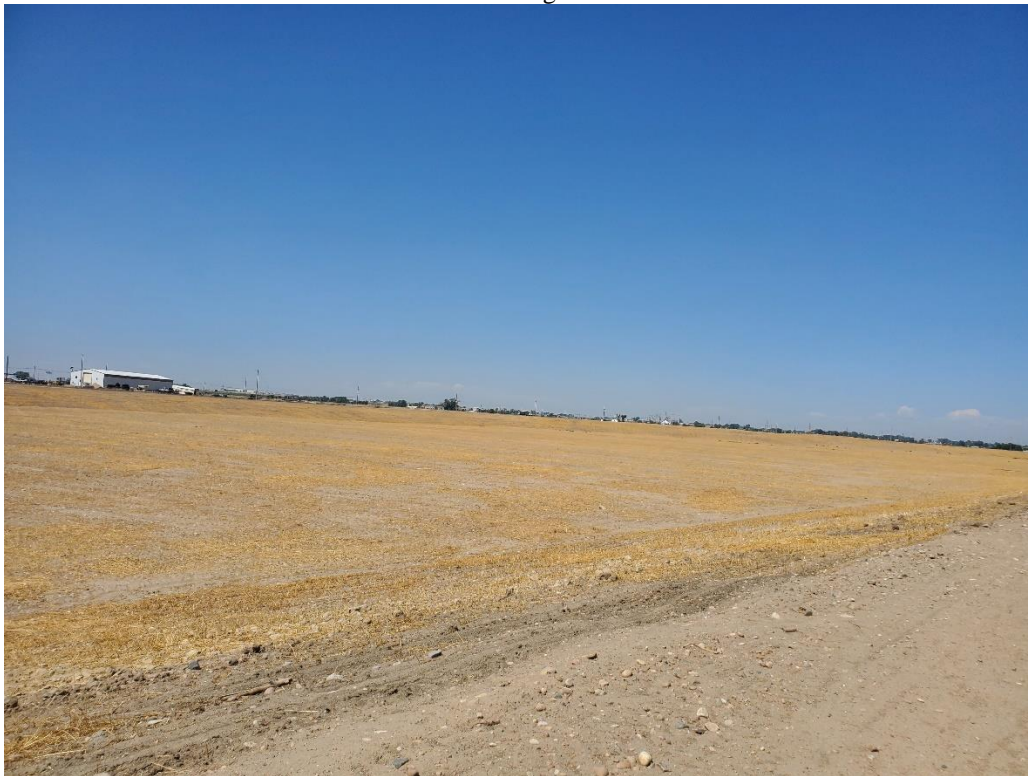
Mine Site Facing Northeast.