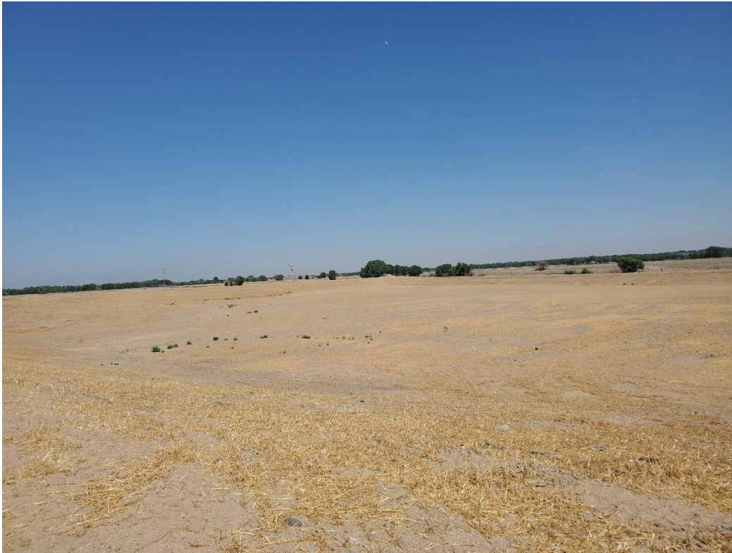
Mine Site Facing Southeast