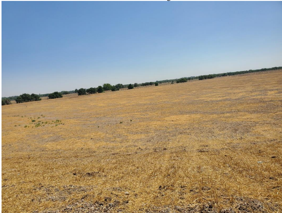
Mine Site Facing Southwest