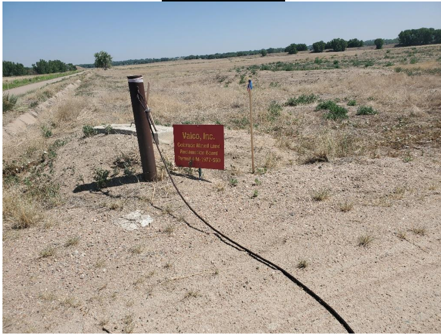
Mine Entrance Sign