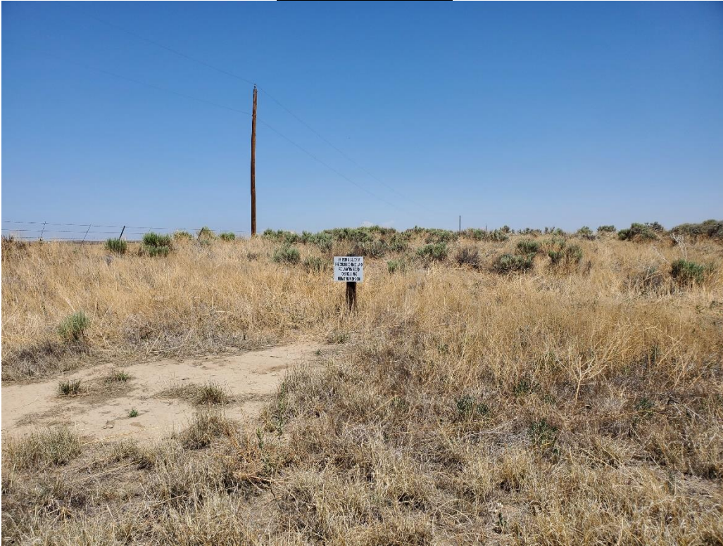
Mine Entrance Sign