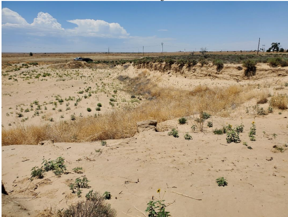
Pit Floor Facing West