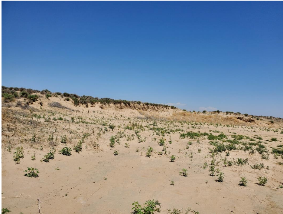
Pit Floor Facing East