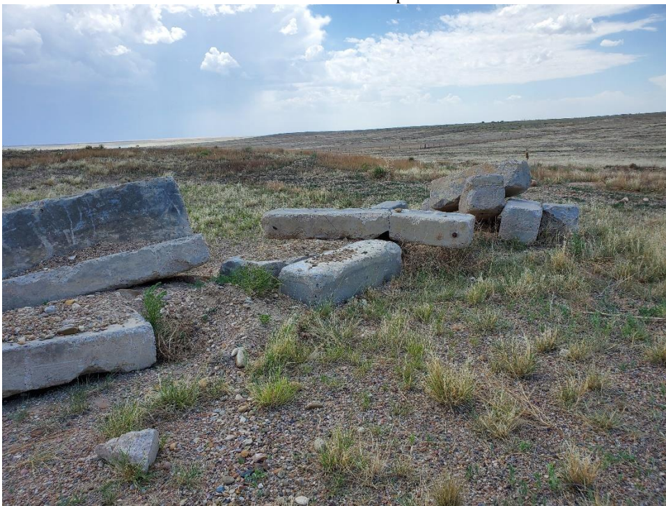
Concrete left onsite