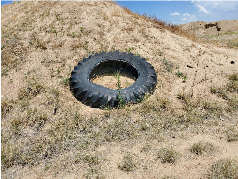
Tire buried in stockpile