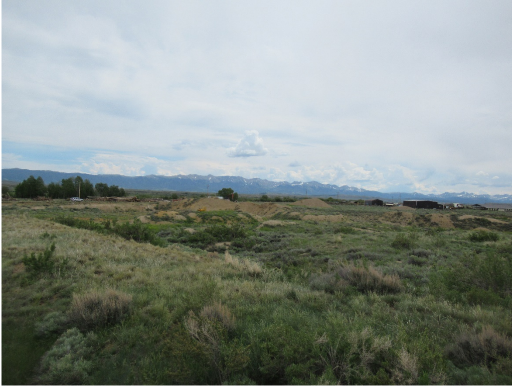
View of the site from the topsoil stockpile looking northeast