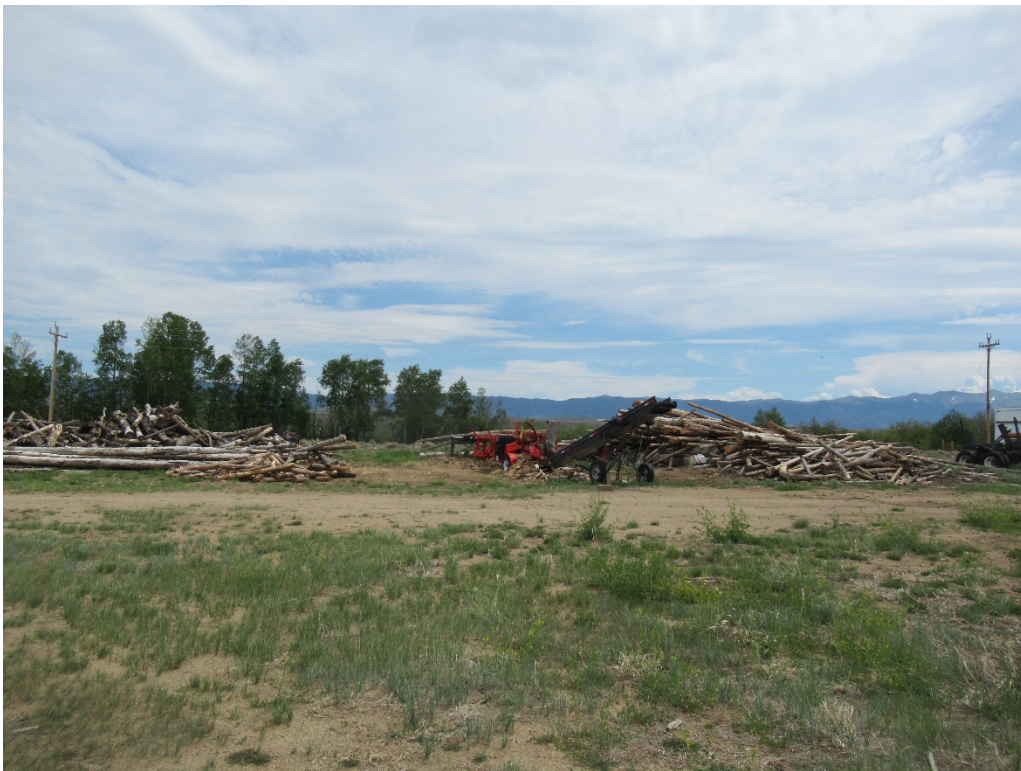
View of the firewood operation in the northern portion of the site