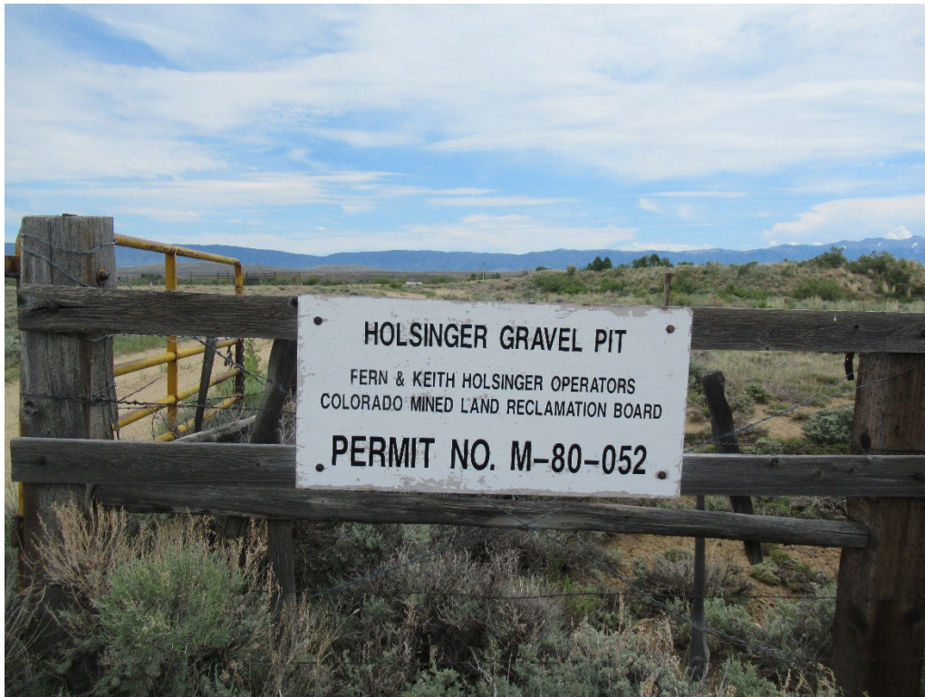
Holsinger Gravel Pit mine sign