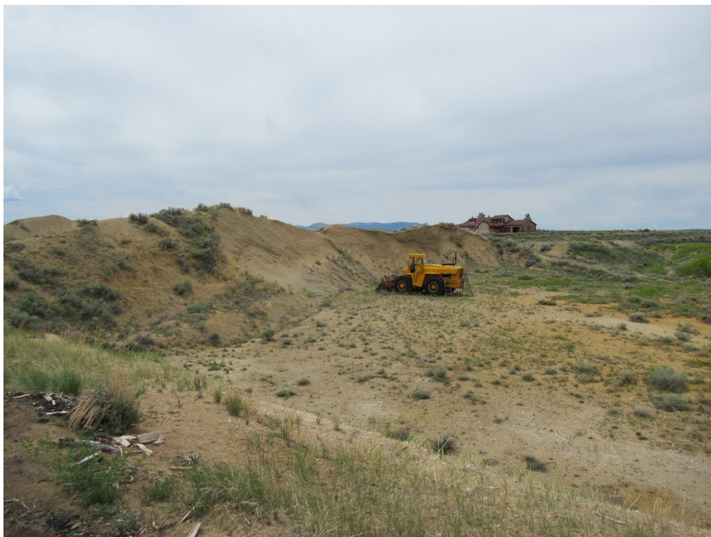
View of the current highwall and pit floor