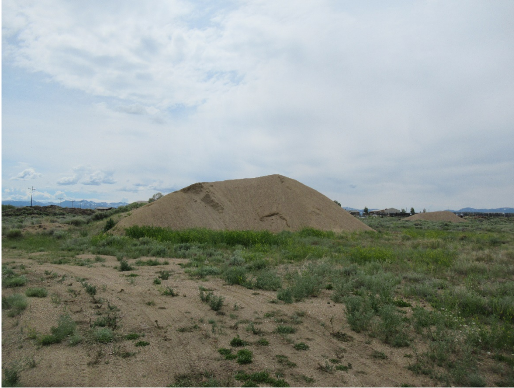
View of the product stockpiles located east of the current highwall