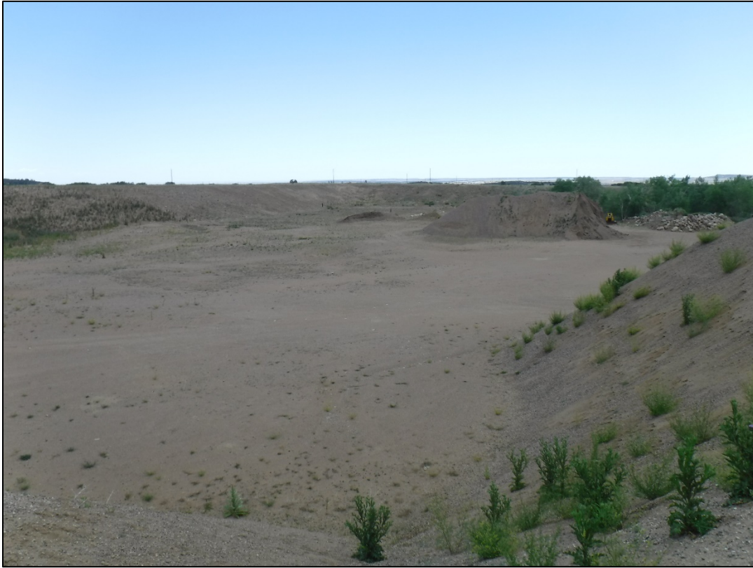
Photo 7: Looking east towards the Colorado City stockpile, pit floor area to be consolidated prior to westward expansion