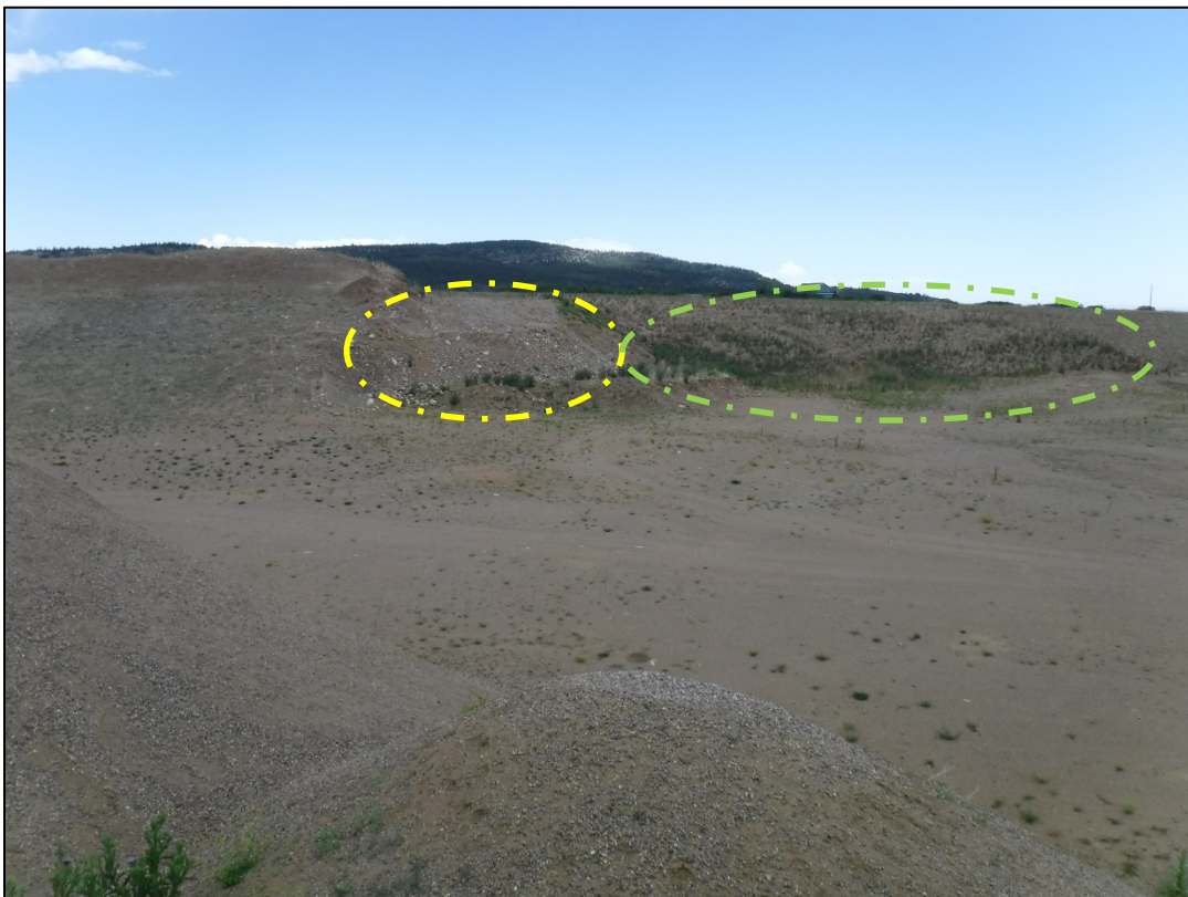
Photo 2: Looking north at the area to be mined (yellow) and area that will be scraped and topsoiled (green)