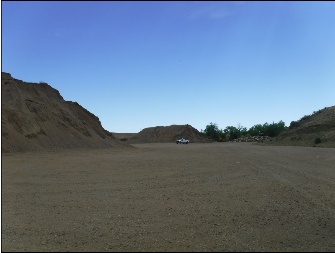
Photo 3: Stockpile in the center behind truck is for Colorado City, stockpile to left is for county