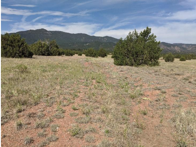
Un-reclaimed light-use road.