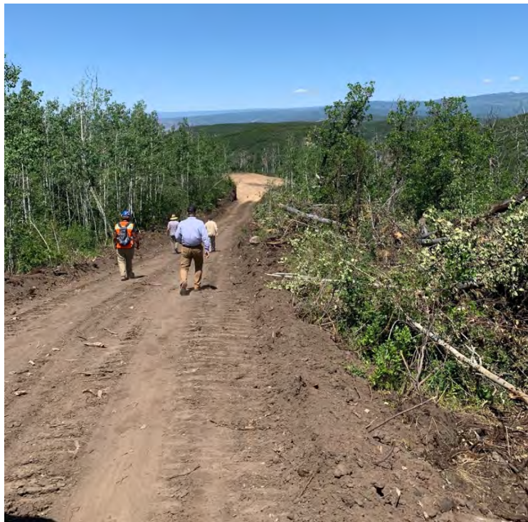
Above: The newly-bulldozed road with drilling pad in the distance.