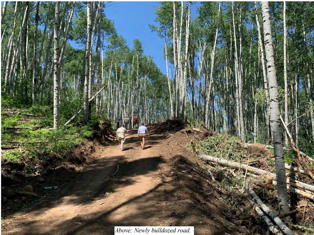
Above: Newly bulldozed road.