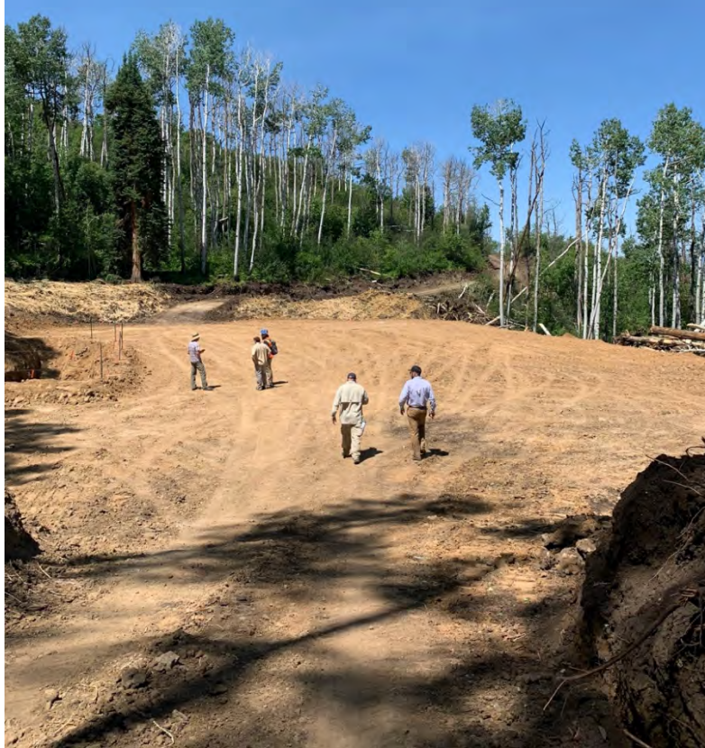
Above: One of the drilling pads bulldozed since Thursday, June 11, 2020.