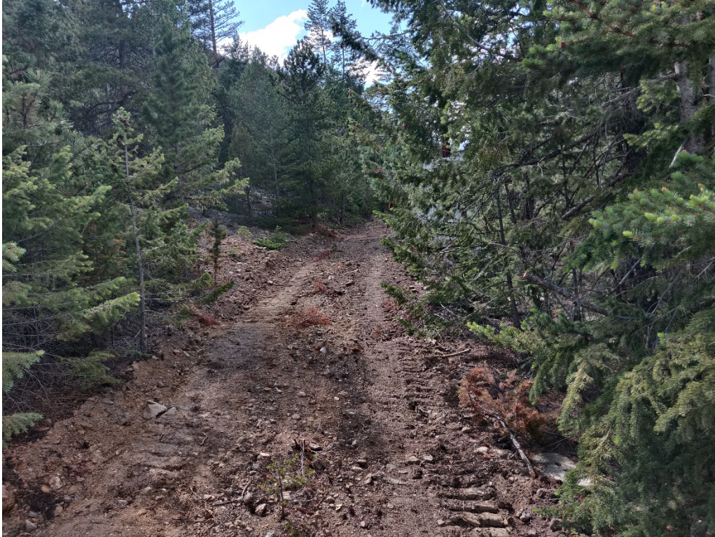
View of the road above the Stanley Mine