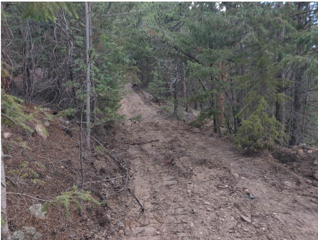
View of the road above the Stanley Mine