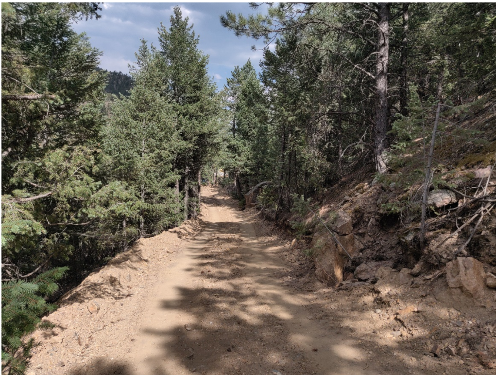
View of the road from Stanley Road to the Gladstone