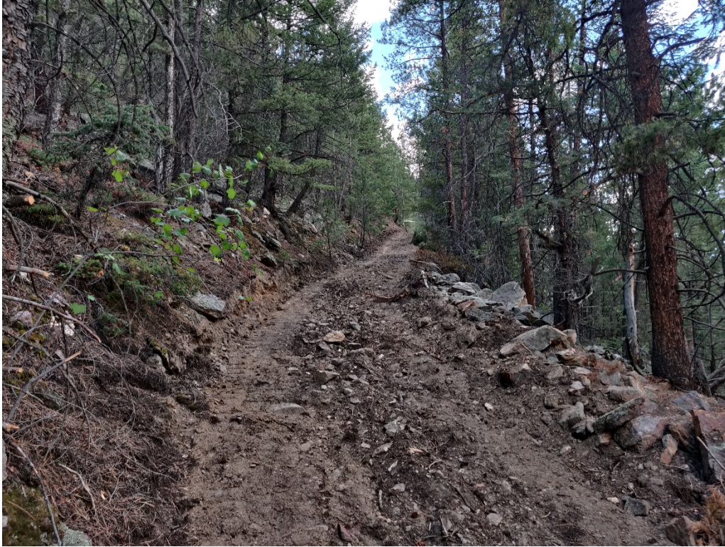
View of the road above the Stanley Mine