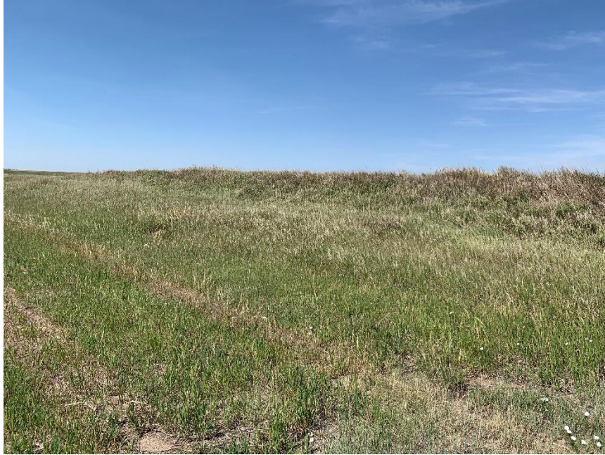
Topsoil Stockpile Along County Road 41 Facing Southwest