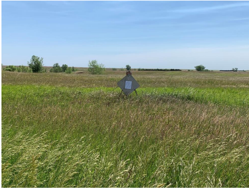
Proposed Mine Application Sign Facing County Road 41