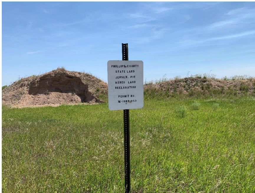
Mine Identification Sign Facing County Road 41