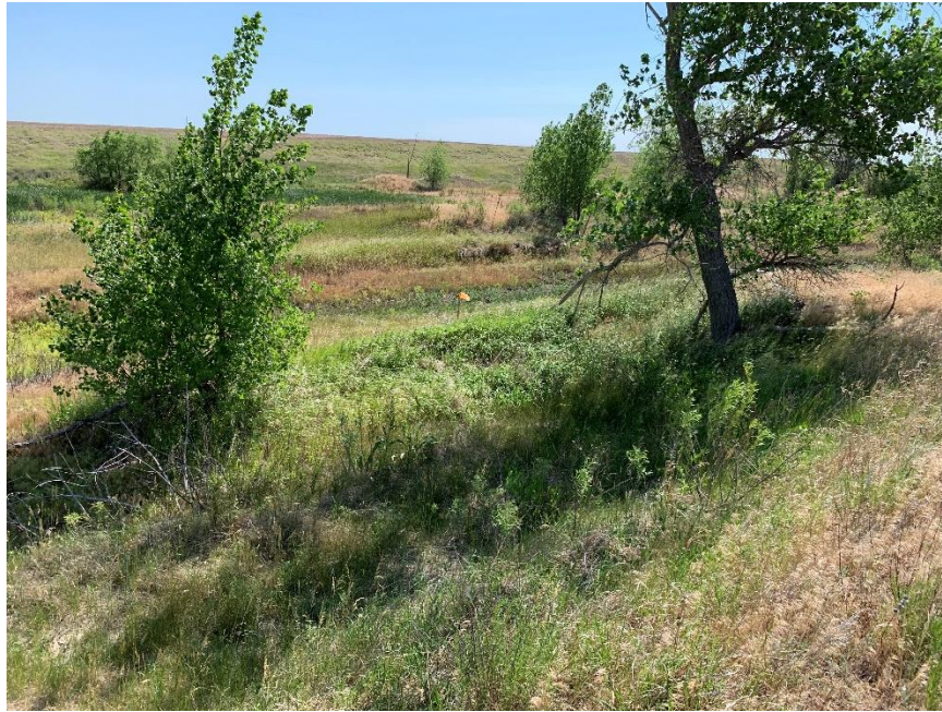
North Marker of the Eastern Most Boundary Facing Northeast