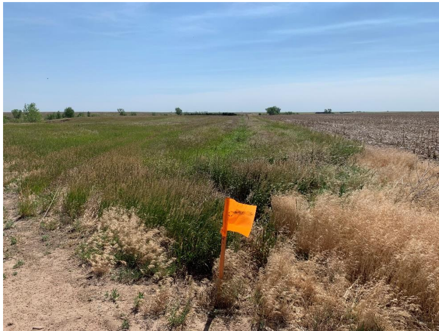
Southern Permit Boundary Marker Looking East