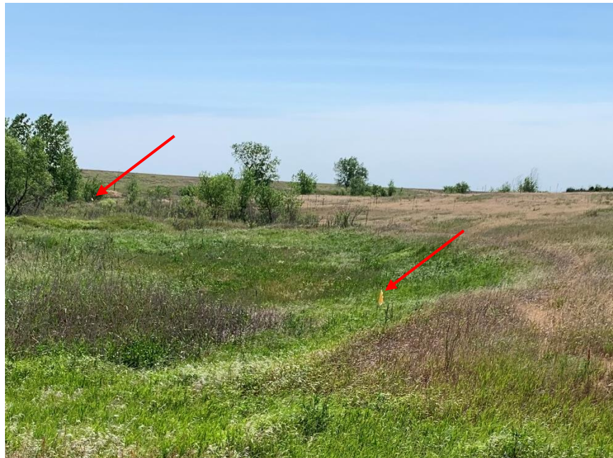
Two Boundary Markers Along Dry Creek Facing East