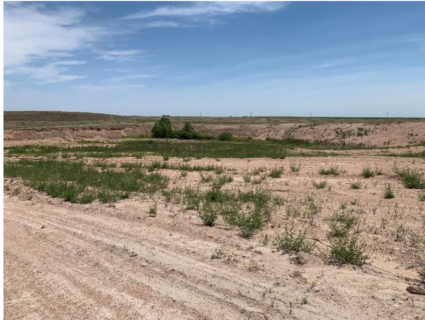
Pit Area Facing Northeast