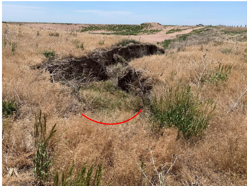
Gully in northwest corner. Picture facing south. Red line indicates head cut area.

Mike Salyards Phillips County 221 S. Interocean Ave. Holyoke, CO 80734