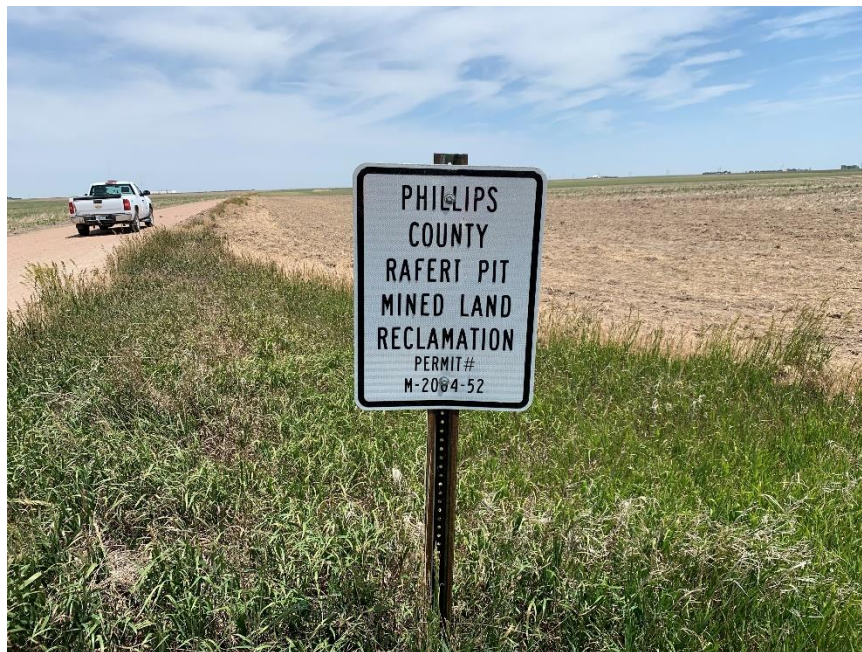
Mine Entrance Sign Facing County Road 26