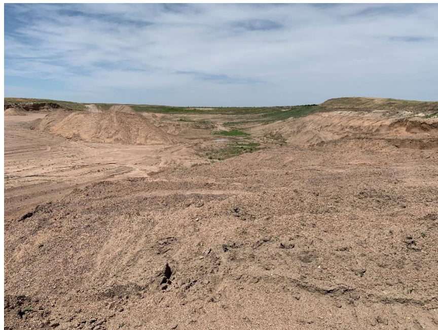
Pit area from northeast corner looking west