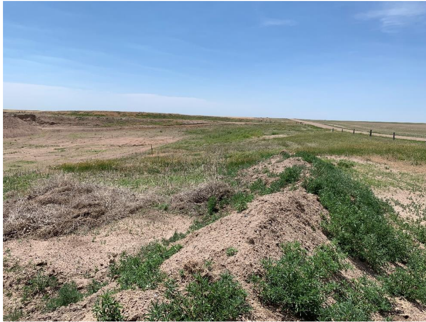
Revegetated area on west side of pit along CR 49, looking south.