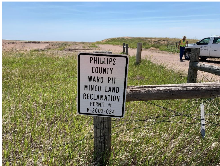
Mine entrance sign facing County Road 49