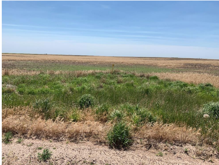
Southeast corner boundary marker.