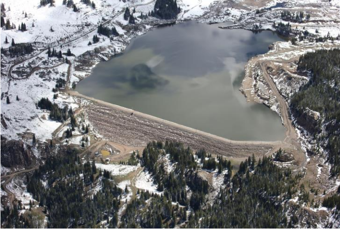
Eagle Park Reservoir-4 Dam

The McNulty and North 40 OSF's were observed. Deposition did not appear to be occurring during this inspection. Several inches of snow covered the OSF's in scattered areas. The current OSF operating plan was drafted by Golder Associates in December 2016. The plan was submitted to the Division as part of TR-25. Climax appears to be in compliance with Golder recommendations for OSF operations. No problems were noted with the OSF's.