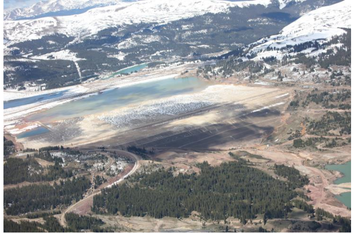
Tenmile Pond-3 Dam