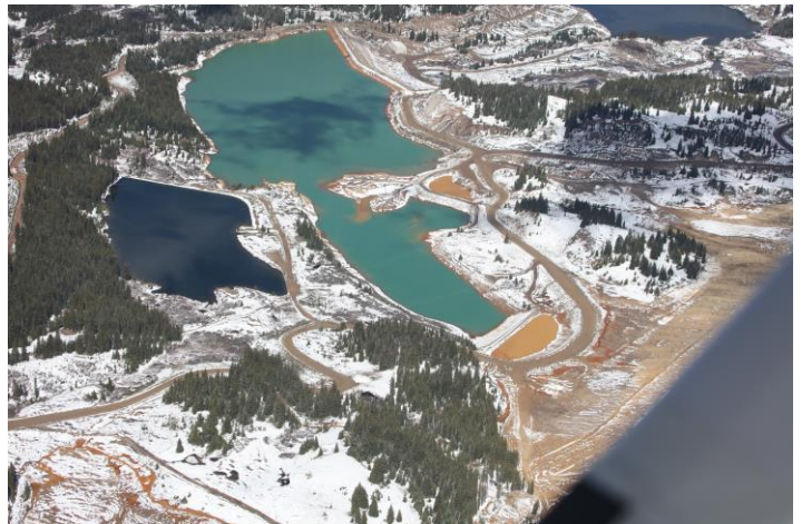
Robinson Lake and Chalk Mountain Reservoir