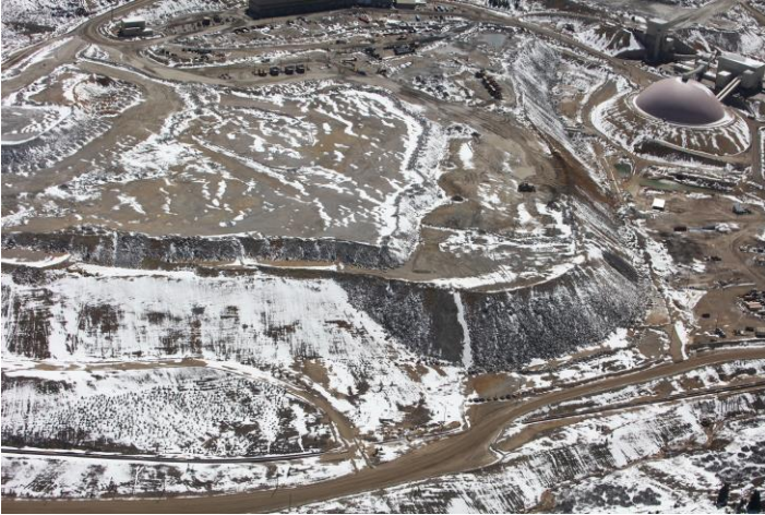
North 40 OSF

No problems or violations were noted during this inspection.